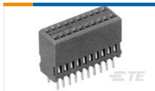
TE Part # 5-104078-9 24 SYSTEM 50 RCPT ASSY DRST SN