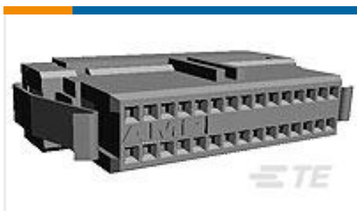
TE Part # 1-111196-9 30 RCPT SYSTEM 50, LEAD FREE