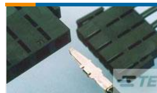
TE Part # 556883-1 CONT,AMPINNRGY WTB,LS PC,14-18