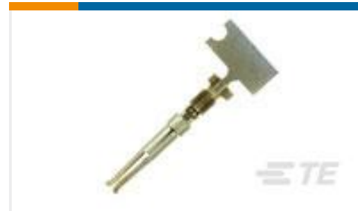
TE Part # 1658543-1 SOCKET CONT DUPL PLT LP HD-20