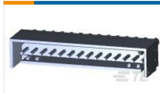
TE Part # 3-644486-4 14P MTA100 SHRDED HDR ASSY SN