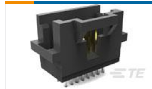
TE Part # 5-104068-3 30 SYSTEM 50 HDR DRST SHRD