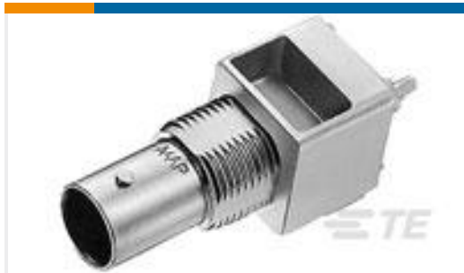
TE Part # 5227671-1 BNC PCB VERTICAL W/PINS