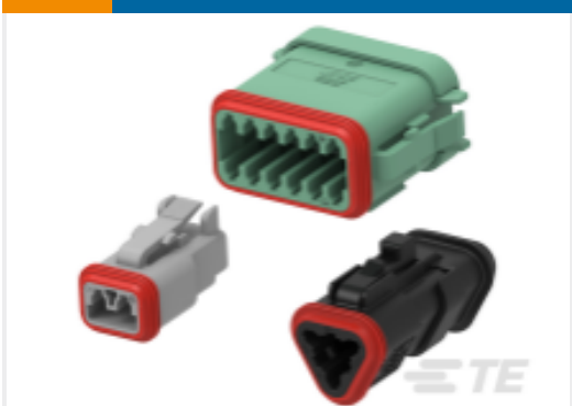
TE Part # DT06-12SA DEUTSCH DT Plug Connectors