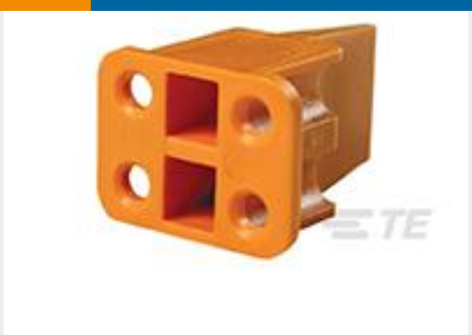
TE Part # WP-4S WEDGE LOCK, 4P, PLG, ORG, DTP