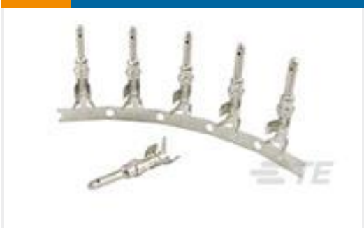
TE Part # 1060-12-0222 PIN, SF, SIZE 12, 10, NI/NI