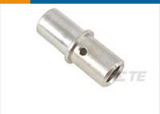
TE Part # 0462-203-04141 SOC, SOLID, SIZE 4, 6AWG, NI