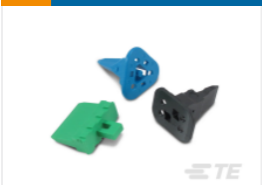
TE Part # W12S Wedgelocks: DEUTSCH DT