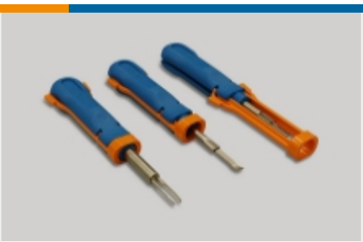
Insertion & Extraction Tools(3)