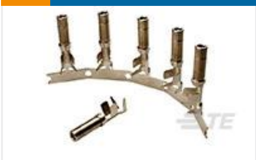
TE Part # 1062-12-0222 SOC, SF, SIZE 12, 10, NI/NI