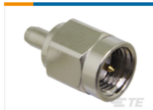
TE Part # CONSM007-R178 SMA Plug 50 Ohm Cable Crimp