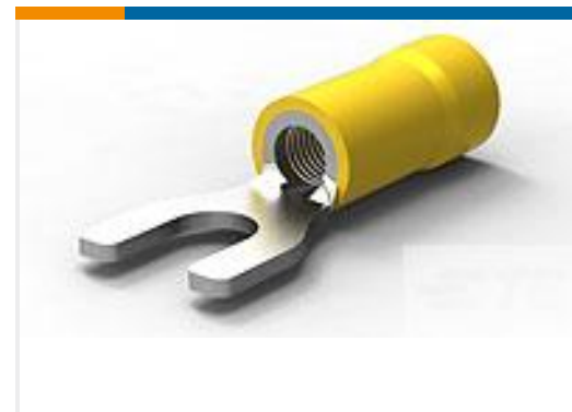
TE Part # 34176 TERMINAL,PG SPD 12-10 10