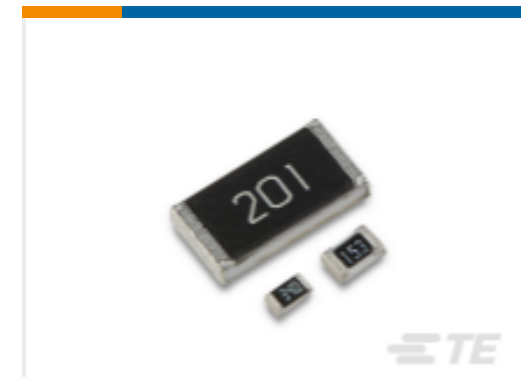
TE Part # 2-2176328-1 CRGP 1206 470R 1%