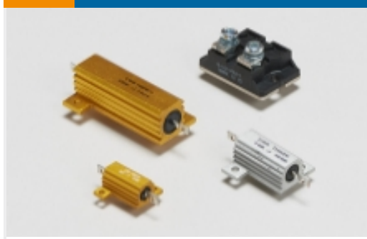
Chassis Mount Resistors(21)