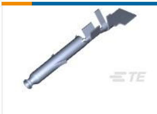
TE Part # 770902-3 MINI UMNL SOK 26-22 AWG AU