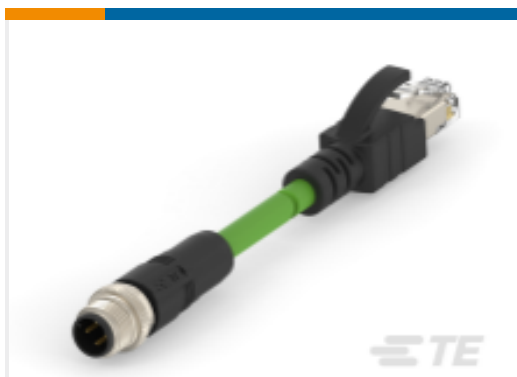
TE Part # TCD14741111-001 M12D4-MS-RJ-PVC-22SH-TYPE B GREEN-0.5M