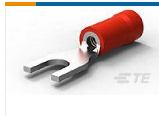
TE Part # 34154 P.G. SPADE