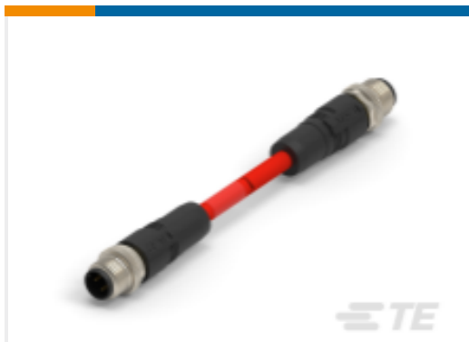
TE Part # TAD14741311-001 M12D4-MS-MS-PVC TYPE B RED-0.5M