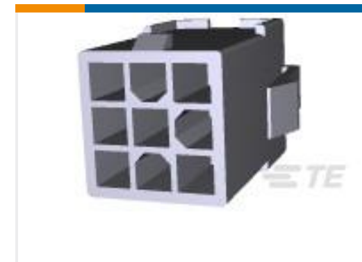
TE Part # 172332-1 MINI UNIVERSAL MATE-N-LOK CAP HOUSING 9P