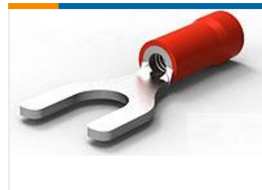
TE Part # 34156 PG SPD 22-16 COMM 22-18 MIL 10