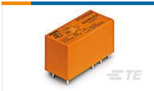
TE Part # 9-1415006-1 RTH34012