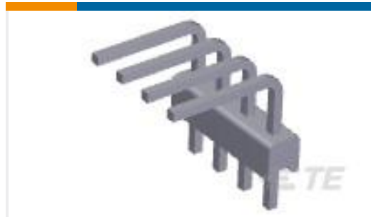
TE Part # 3-644457-4 04P MTA100 HDR ASSY R/A NARROW