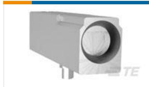
TE Part # 5223986-1 UPM KEYED GUIDE MODULE