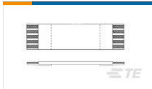
TE Part # 2127674-1 FFC JUMPER, .050 C/L, 20-COND,