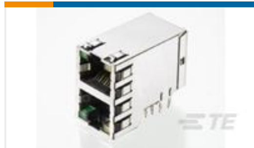
TE Part # 1888653-5 2X1 OFFSET ST/JK WITH LEDS