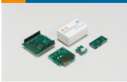
Sensor Development Boards and Evaluation Kits(2)