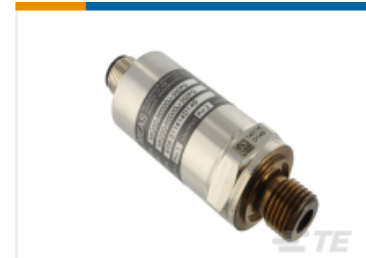
TE Part # M5244-000002-350BG PRESS XDCR M5244-000002-350BG