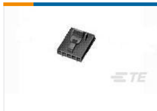
TE Part # 104257-4 05 MTE RCPT HSG SR LATCH .100