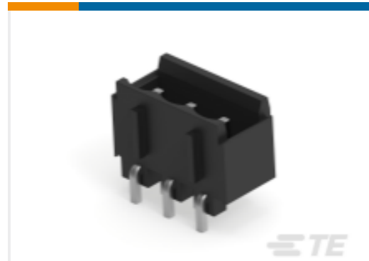
TE Part # 2305908-3 SMT TB R/A HEADER, 5.0MM, 3 POS