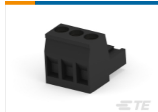
TE Part # 2305909-3 SMT TB PARALLEL PLUG, 5.0MM, 3 POS