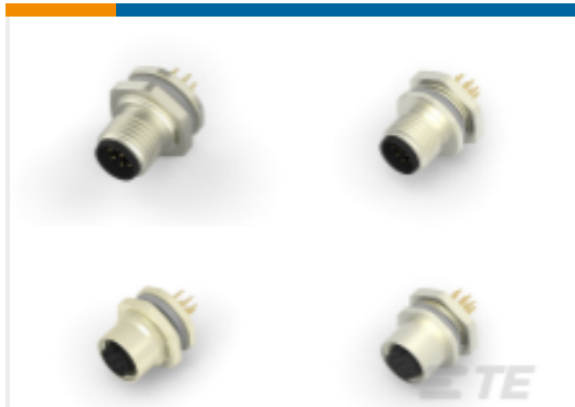
TE Part # T4140012041-000 M12 Panel Mount PCB