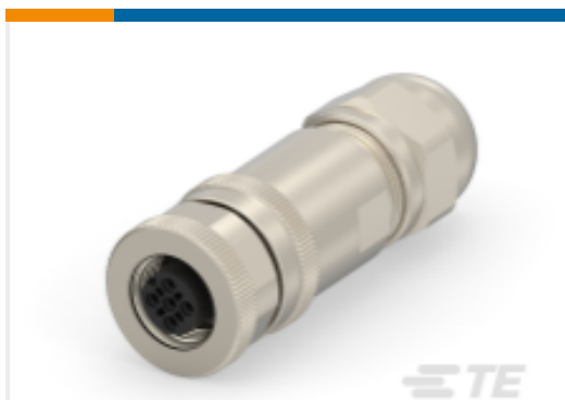
TE Part # T4110011051-000 M12 F, 5P GOLDR A_CODE S SHIELDED PG7