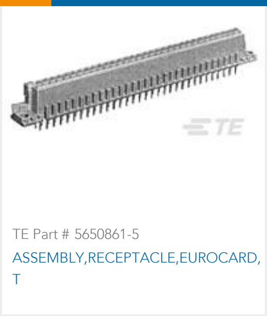
TE Part # 5650861-5 ASSEMBLY, RECEPTACLE, EUROCARD, T