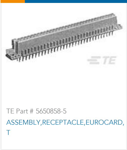
TE Part # 5650858-5 ASSEMBLY, RECEPTACLE, EUROCARD, T