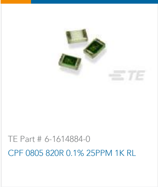
TE Part # 6-1614884-0 CPF 0805 820R 0.1% 25PPM 1K RL