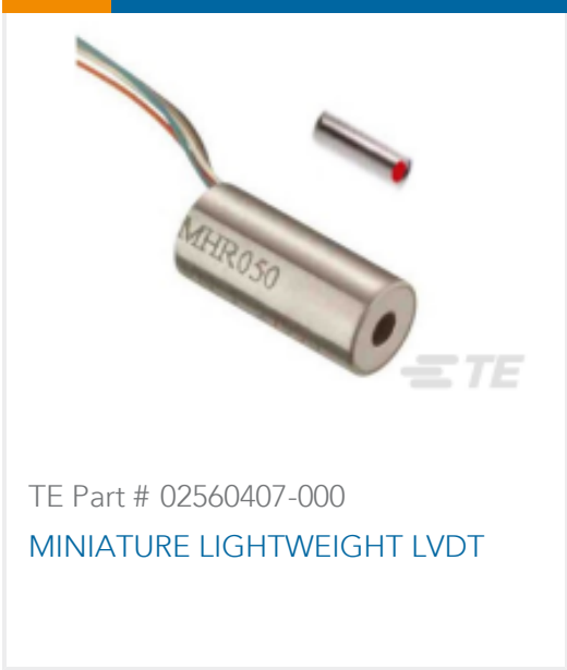
TE Part # 02560407-000 MINIATURE LIGHTWEIGHT LVDT