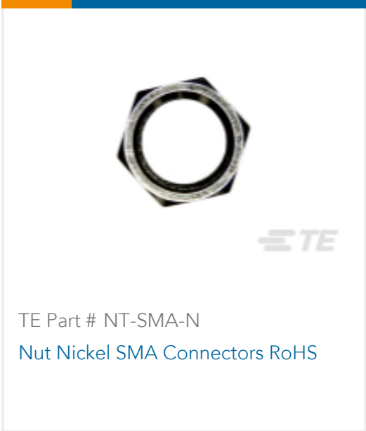
TE Part # NT-SMA-N Nut Nickel SMA Connectors RoHS

Datasheets & Catalog Pages Miniature General Purpose AC LVDT English