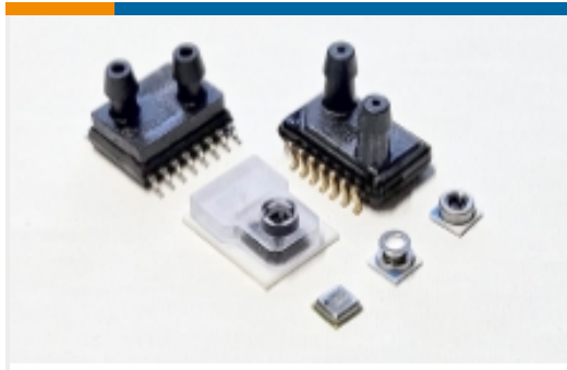
Board Mount Pressure Sensors(35)