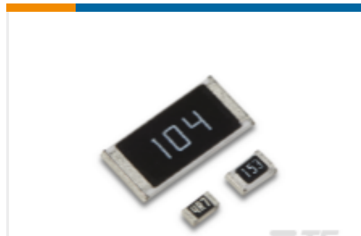
TE Part # 3-2176349-5 CRGCO 2512 6K8 1%