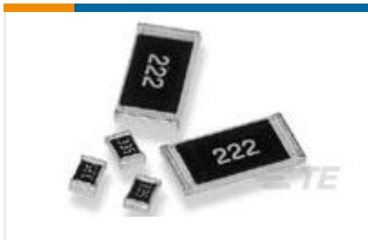
TE Part # 1879508-1 CRGH0805 1% 10R 0.33W