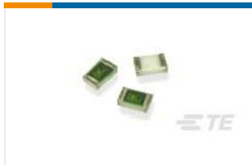
TE Part # 2-2176087-6 RP 1J 0.166W 124R 0.1% 25PPM 1K RL