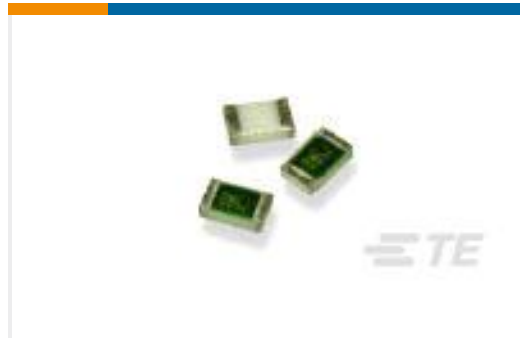
TE Part # 6-1614884-4 CPF 0805 1K2 0.1% 25PPM 1K RL