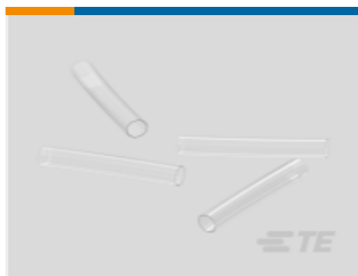
TE Part # NB26672001 TFER-5/8-X-STK