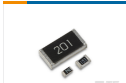
TE Part # 3-2176326-8 CRGP 0603 12K 1%