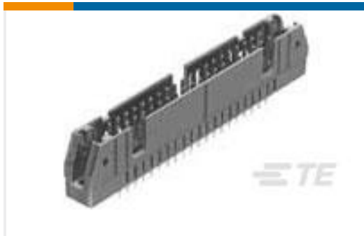
TE Part # 1658694-4 AMP-LATCH UNV HDR,50 POSN,VERT