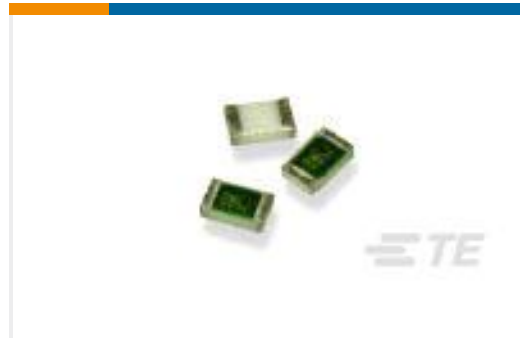
TE Part # 5-1614884-6 CPF 0805 560R 0.1% 25PPM 1K RL