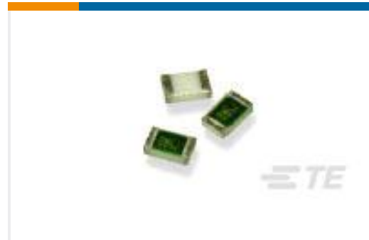
TE Part # 1614885-5 CPF 0805 82K 0.1% 25PPM 1K RL