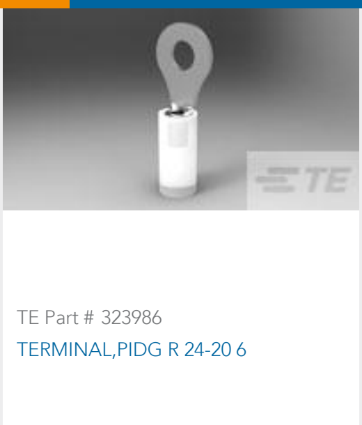
TE Part # 323986 TERMINAL,PIDG R 24-20 6