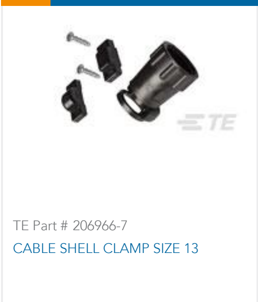
TE Part # 206966-7 CABLE SHELL CLAMP SIZE 13