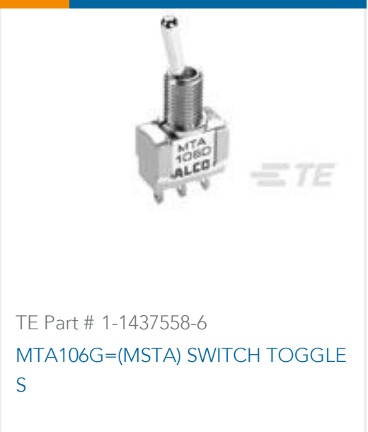
TE Part # 1-1437558-6 MTA106G=(MSTA) SWITCH TOGGLE S