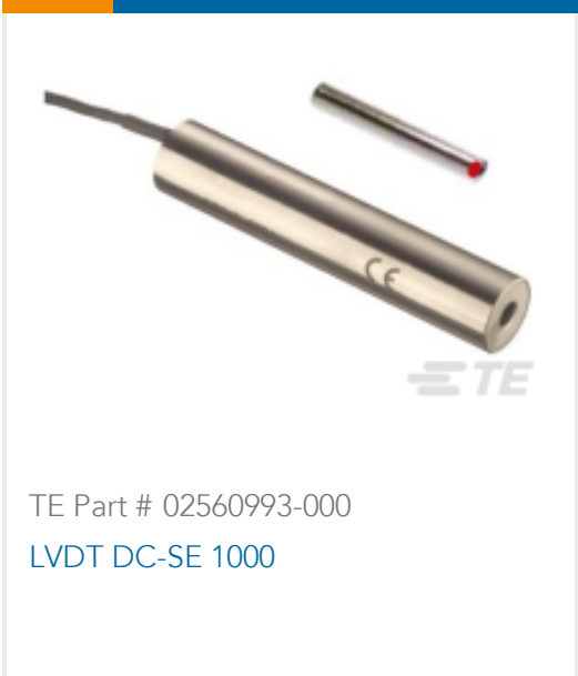
TE Part # 02560993-000 LVDT DC-SE 1000