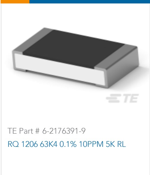
TE Part # 6-2176391-9 RQ 1206 63K4 0.1% 10PPM 5K RL