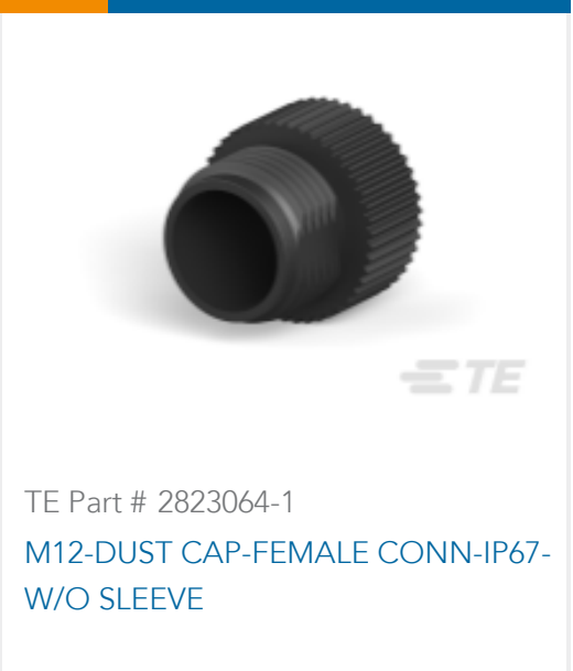
TE Part # 2823064-1 M12-DUST CAP-FEMALE CONN-IP67-W/O SLEEVE