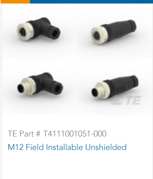
TE Part # T4111001051-000 M12 Field Installable Unshielded