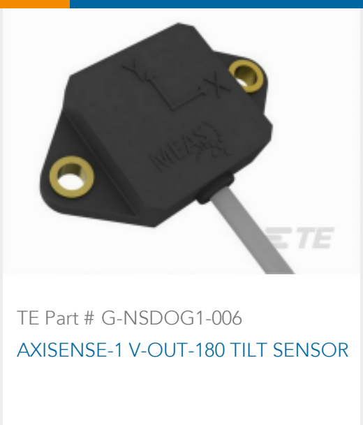
TE Part # G-NSDOG1-006 AXISENSE-1 V-OUT-180 TILT SENSOR