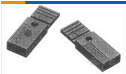
TE Part # 2-881545-2 AMP SHUNT LOW PROFI