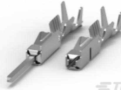
TE Part # 5-962886-1 MQS, RECEPTACLE AND TAB