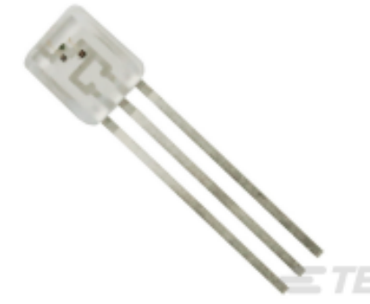
TE Part # ELM-4001 EMITTER ASSEMBLY