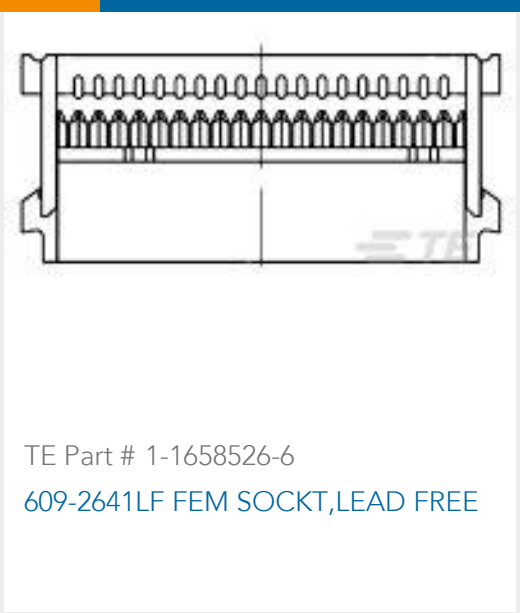
TE Part # 1-1658526-6 609-2641LF FEM SOCKET, LEAD FREE