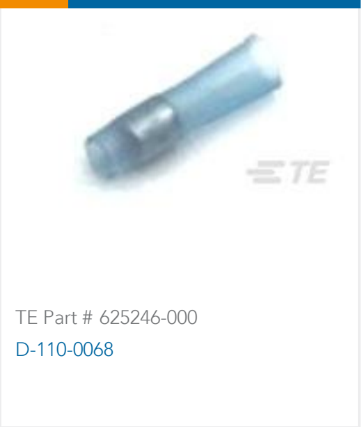
TE Part # 625246-000 D-110-0068