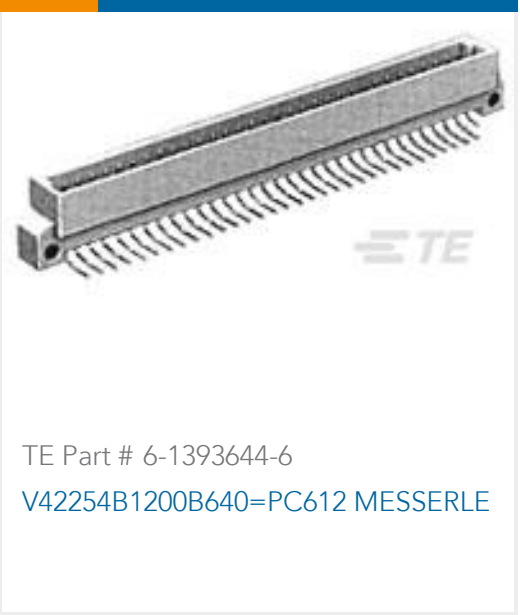
TE Part # 6-1393644-6 V42254B1200B640=PC612 MESSERLE