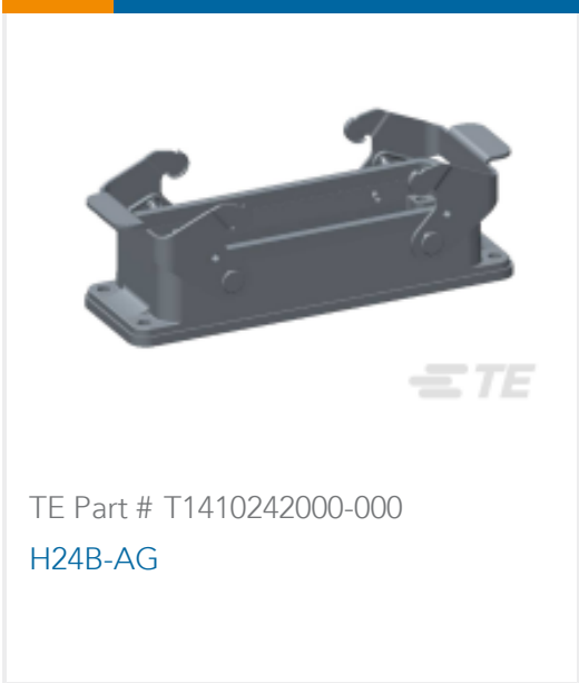
TE Part # T1410242000-000 H24B-AG