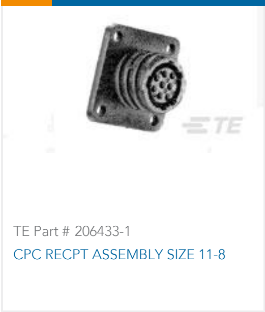
TE Part # 206433-1 CPC RECPT ASSEMBLY SIZE 11-8