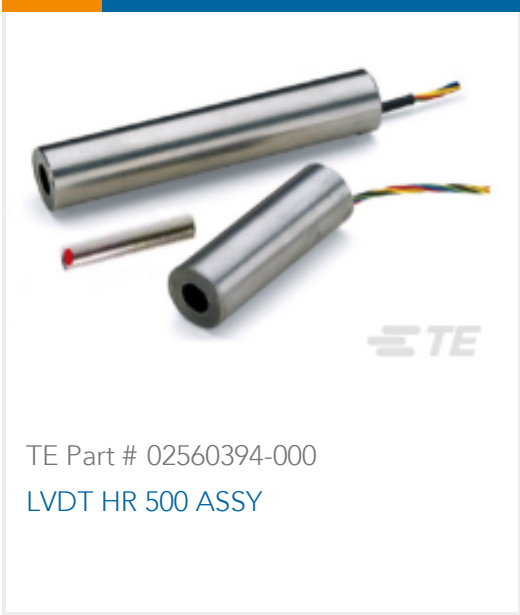
TE Part # 02560394-000 LVDT HR 500 ASSY