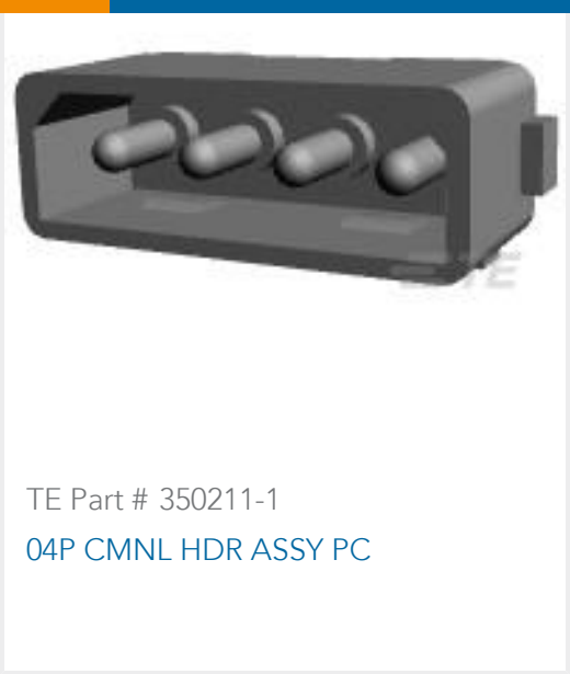
TE Part # 350211-1 04P CMNL HDR ASSY PC