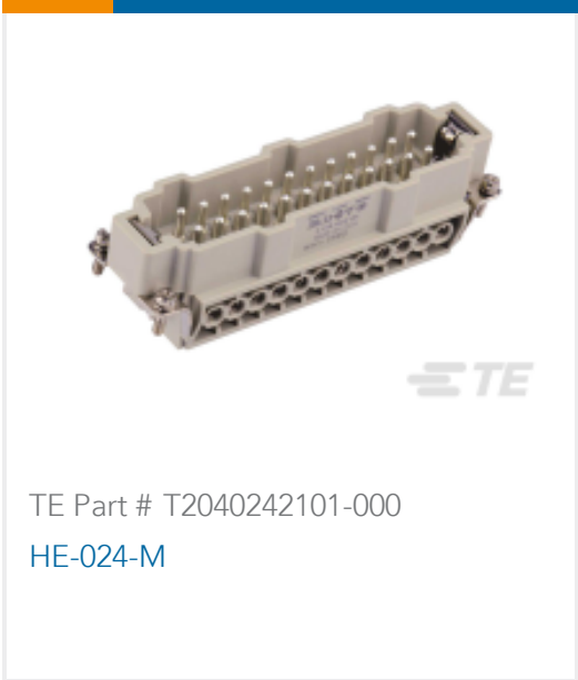
TE Part # T2040242101-000 HE-024-M