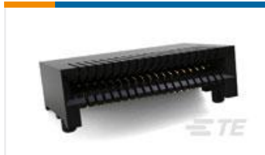
TE Part #1-1761987-8 Receptacle Conn Assm 38 Pos Tape/Re