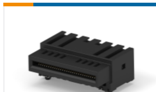
TE Part #2344064-4 CONNECTOR ASSEMBLY, SMT, OSFP 112