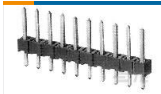
TE Part #826629-1 AMPMODU II PIN HDR. 1X01P