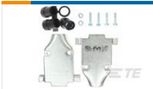
TE Part #5748676-2 DIE CAST CBL CLMP KIT, SZ 2