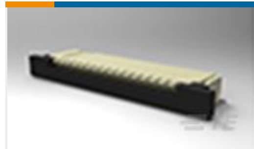
TE Part #84953-8 1MM FPC HORZ. TOP CONT. ASSY 8P