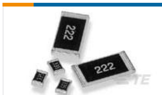
TE Part #5-1879501-7 CRGH2512 5% 220R 2W