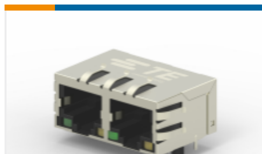
TE Part #5-2301996-8 RJ45 JACK INT. MAG. 1GB LED 1X2