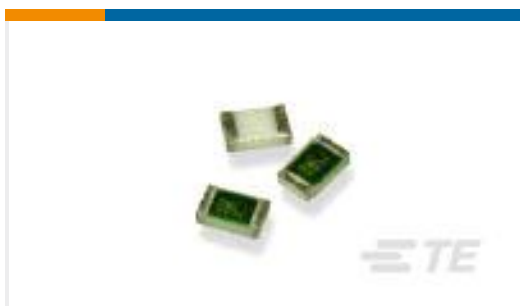
TE Part #3-1879215-1 CPF 0402 8K45 0.1% 25PPM 1K RL