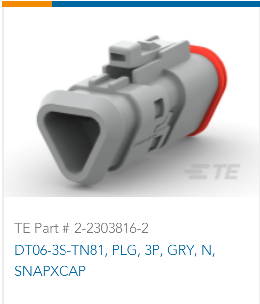
TE Part # 2-2303816-2 DT06-3S-TN81, PLG, 3P, GRY, N, SNAPXCAP