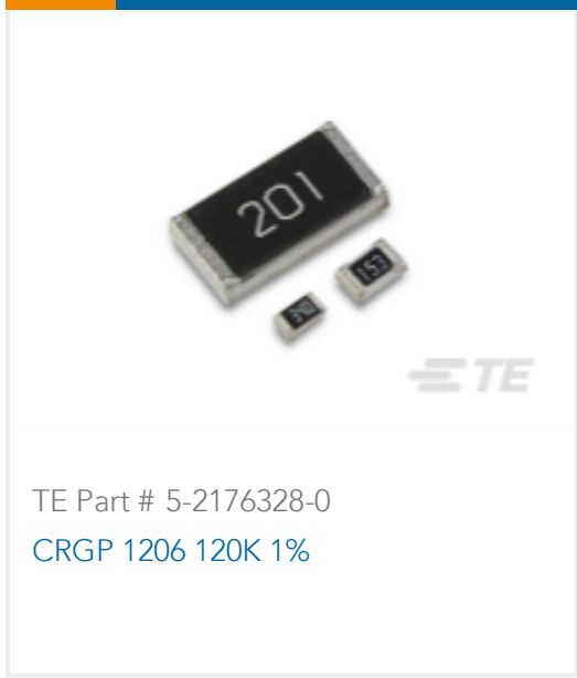
TE Part # 5-2176328-0 CRGP 1206 120K 1%