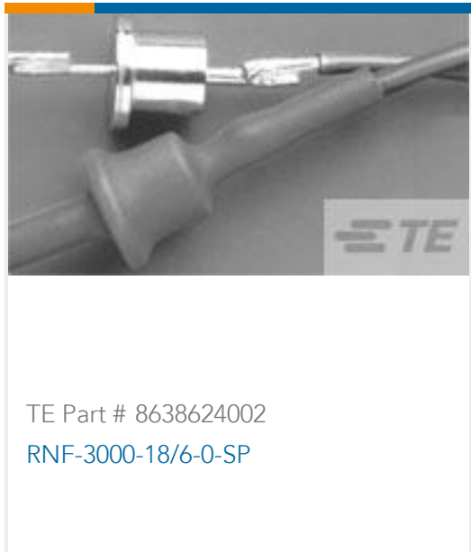
TE Part # 8638624002 RNF-3000-18/6-0-SP