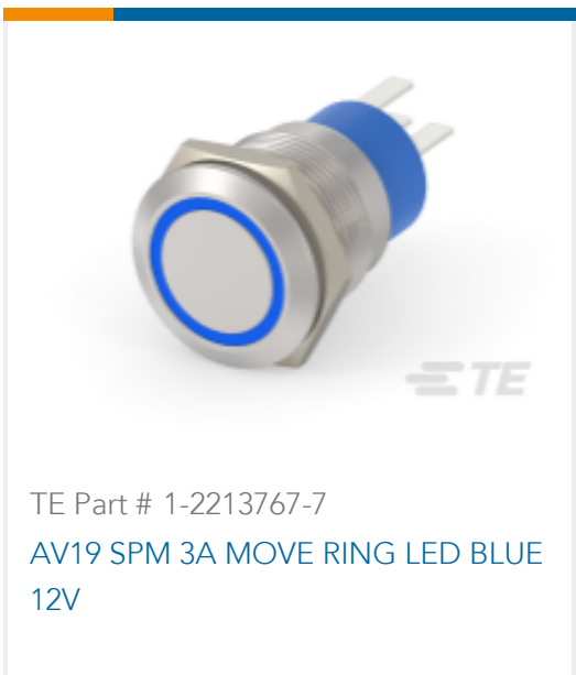
TE Part # 1-2213767-7 AV19 SPM 3A MOVE RING LED BLUE 12V