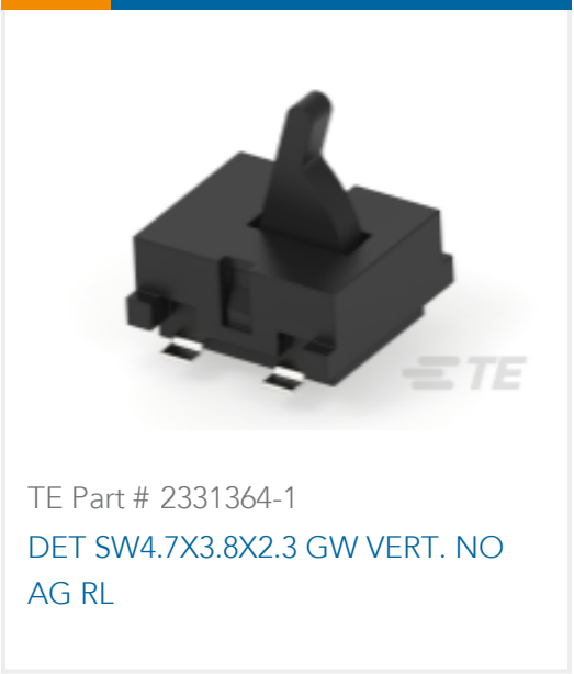
TE Part # 2331364-1 DET SW4.7X3.8X2.3 GW VERT. NO AG RL