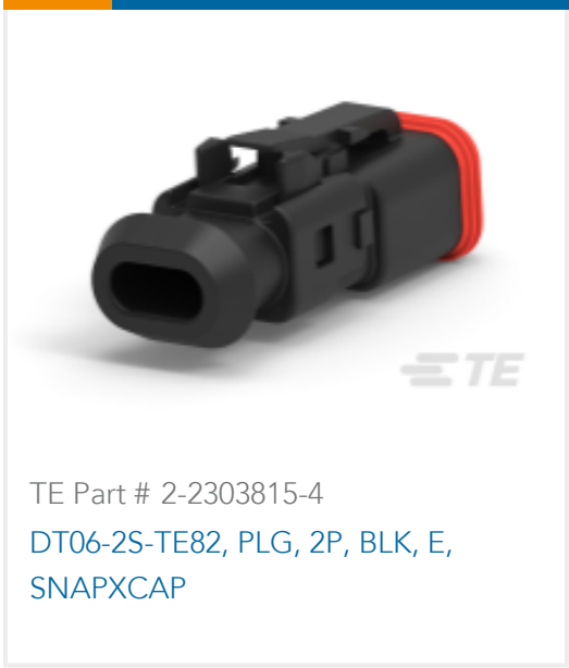
TE Part # 2-2303815-4 DT06-2S-TE82, PLG, 2P, BLK, E, SNAPXCAP