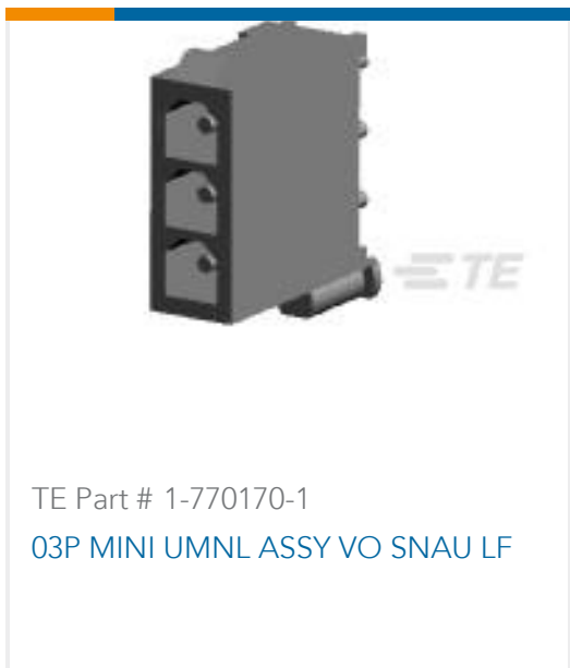
TE Part # 1-770170-1 03P MINI UMNL ASSY VO SNAU LF