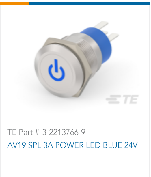
TE Part # 3-2213766-9 AV19 SPL 3A POWER LED BLUE 24V