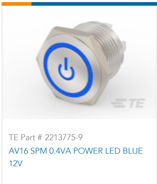
TE Part # 2213775-9 AV16 SPM 0.4VA POWER LED BLUE 12V