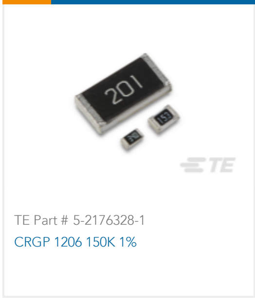
TE Part # 5-2176328-1 CRGP 1206 150K 1%