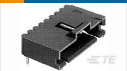
TE Part # 5-104935-5 02 MTE HDR SRRA LATCH