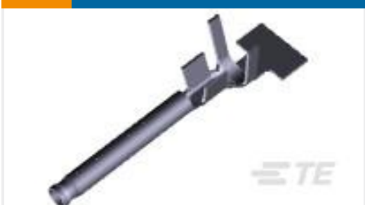
TE Part # 171637-1 MINI U-M-N-L SOCKET CONTACT