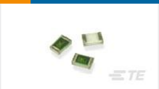
TE Part # 2-1625867-4 RP 1J 0.166W 10R7 0.1% 25PPM 1K RL