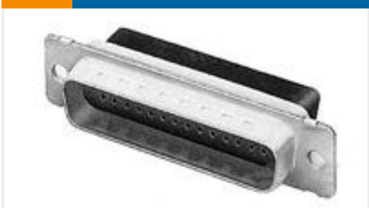
TE Part # 748364-1 15 HD22 CRIMP SNAP PLUG