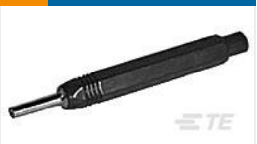
TE Part # 1102855-7 AWZG-HE-Q5-RSZ