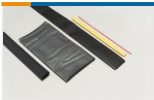
Heat Shrink Tubing(220)