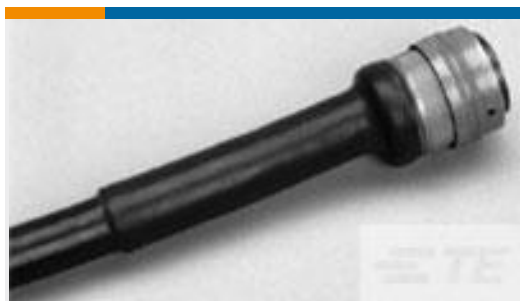
TE Part # 1927574004 ATUM-6/2-2-SP