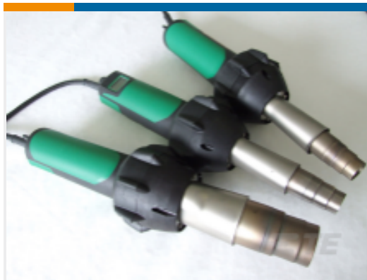
TE Part # EG1114-000 CV1981-ST-230V1600W-EU