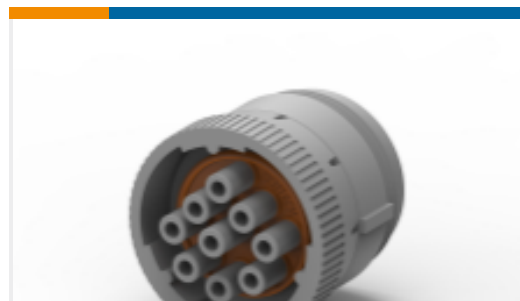
TE Part # HD16-9-96SE PLUG ASM