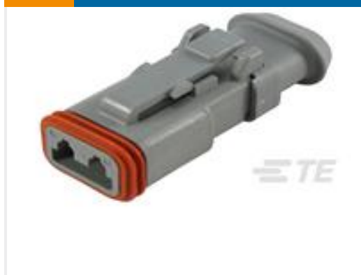
TE Part # DT06-2S-E008 PLG, 2P, GRY, N, XCAP