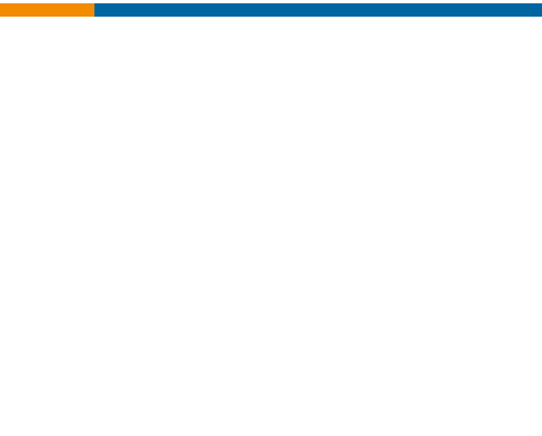
TE Part # M15513-22A TOOL INS-REM