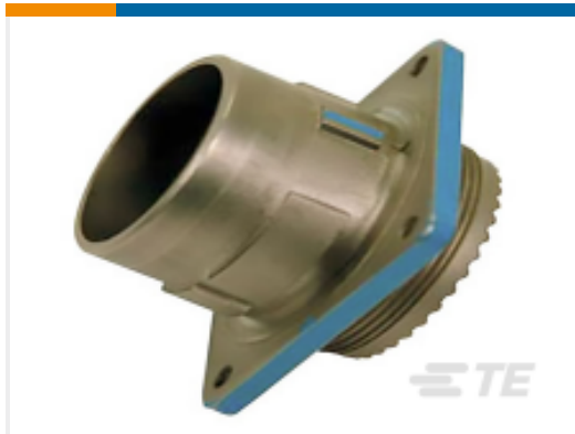
TE Part # YDIV40E25-19SCC009 RECP ASSY