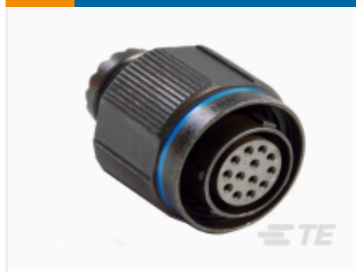
TE Part # YDTS26T17-06PCV001 PLUG ASSY