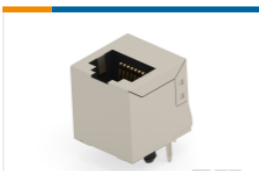
TE Part # 203512-E MJ HS V5 * 8 8 * * * * 999999 30 * J 3 1