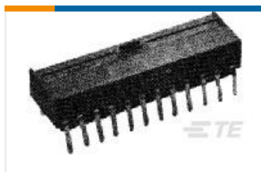
TE Part # 280581-2 MOD II SGL ROW 15P REC. ASSY HMT, Au