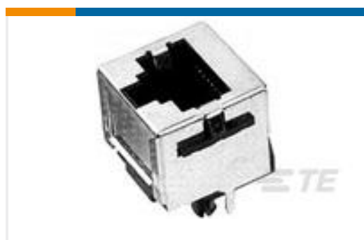
TE Part # 3-1734577-4 MOD-JK,8P8C,SHD W/O LED, 50u"