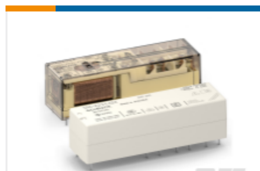
TE Part # 7-1415537-1 Force Guided Relay with 6 contacts