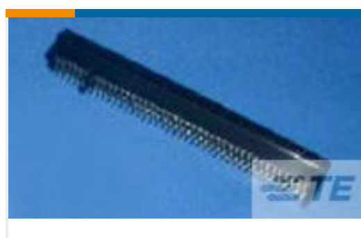
TE Part # 7-1734774-5 PCI EXP 2.3L 36 POS WHT 15u"