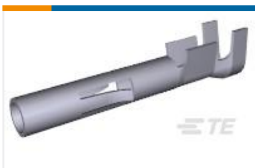
TE Part # 350550-7 UMNL SOK 20-14 AU/BR L/P