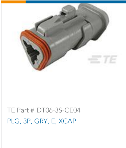
TE Part # DT06-3S-CE04 PLG, 3P, GRY, E, XCAP