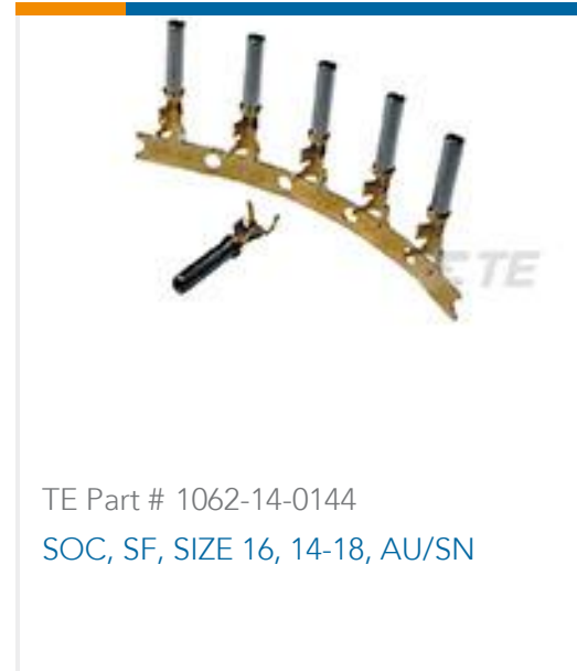
TE Part # 1062-14-0144 SOC, SF, SIZE 16, 14-18, AU/SN