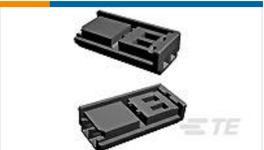
TE Part # 1-1534113-1 2POS MOS REC