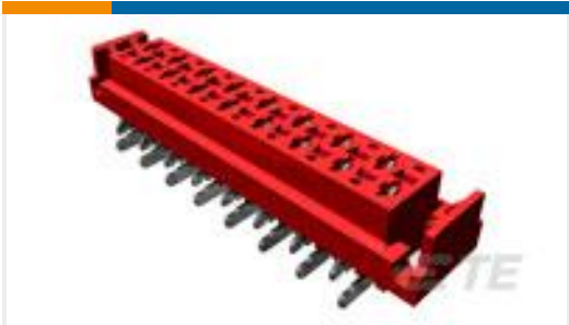
TE Part # 7-338069-6 MICRO-MATCH SMD FTE