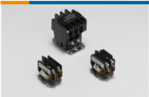
Definite Purpose Contactors(1)