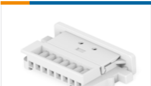
TE Part # 1719183-2 8POS MOS REC COD B