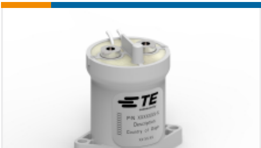
TE Part # 2138622-1 RELAY, EVC135, 26 OHM COIL (15" WIRE)