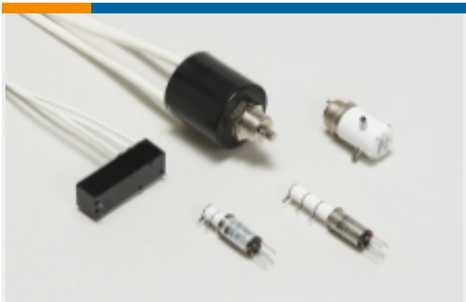
High Voltage Relays(17)