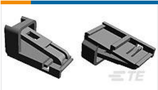
TE Part # 1534112-1 MOS RETAINER FOR 2POS REC.HSG