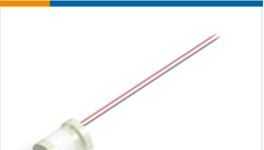
TE Part # 2071407-1 IHV50A4ANG