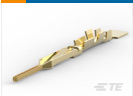
TE Part # 86561-6 ROUND WIRE PIN L.P.