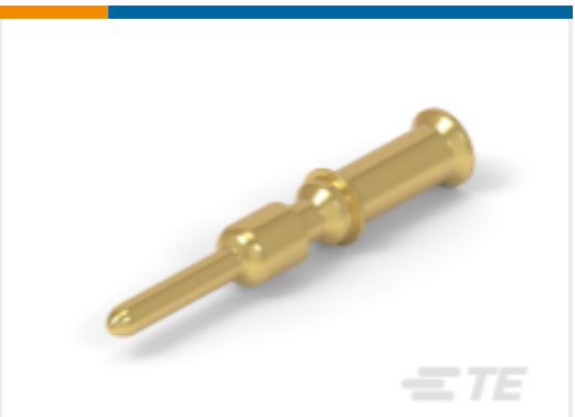
TE Part # 61-0239-011-000 CONTACT PIN 1 MM