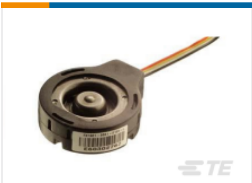
TE Part # FX1901-0001-0200-L 200 LBF COMPRESSION LOAD CELL 100MV