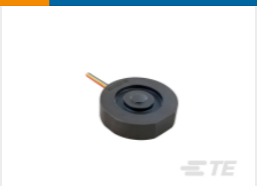
TE Part # 20009605-20 FX29K0-100A-0010-L