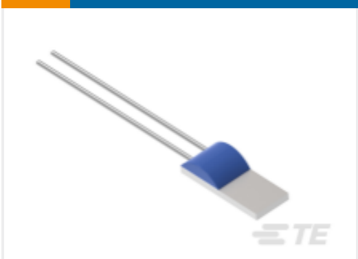
TE Part # NB-PTCO-168 Pt1000, 2.0x5.0, Class A, PTFD102A1G0