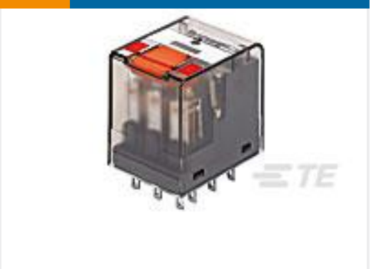
TE Part # 9-1415536-4 PT381024