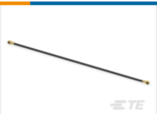
TE Part # 1-2016698-2 RF CA,UMCC GEN4-GEN4,1.13MM CABLE,L100MM