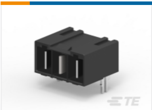
TE Part # 2204529-1 ELCON MINI 3P RA HEADER,SOLDER, T/P