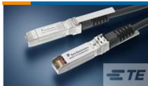
TE Part # 2127933-7 C/A, SFP+, GENERIC, 6.0M