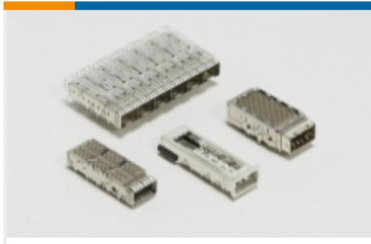
Pluggable IO Connectors & Cages(1)