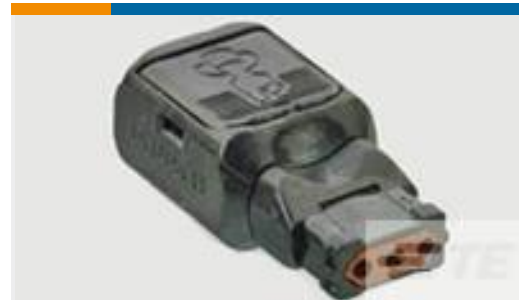
TE Part # D369-R33-CS0 369 3 WAY REC, NO CONTACTS, SKT