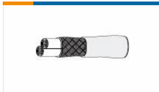
TE Part # 316153-000 55A1121-18-6/9-9