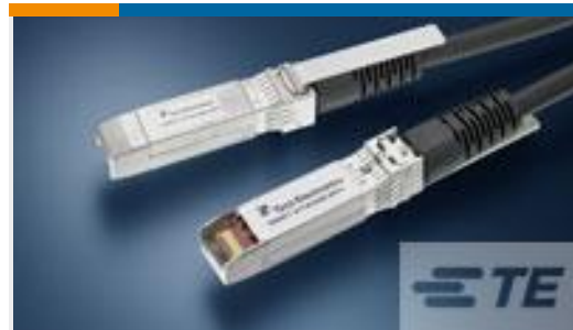
TE Part # 2127934-1 C/A, SFP+, GENERIC, 0.5M