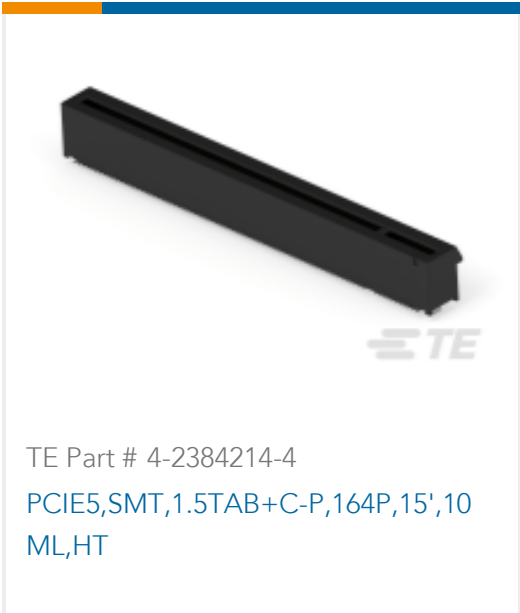
TE Part # 4-2384214-4 PCIE5,SMT,1.5TAB+C-P,164P,15',10 ML,HT