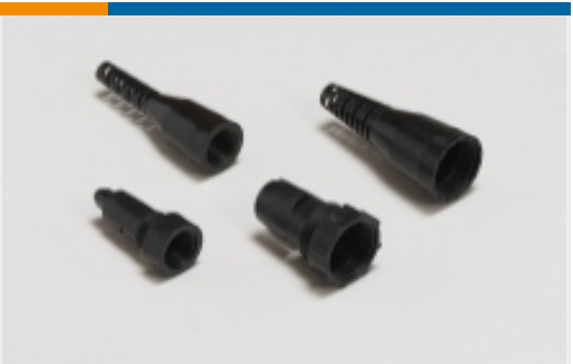
Connector Strain Relief(11)