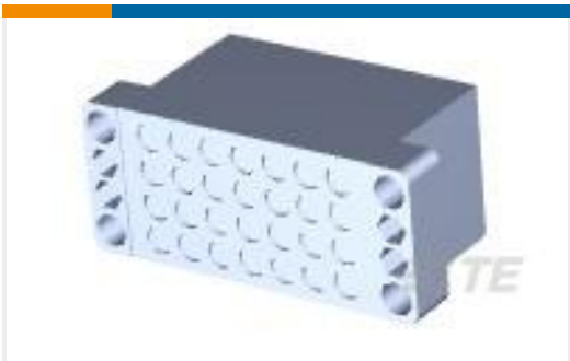
TE Part # 205689-2 PIN BLOCK 28 POS. SPL.