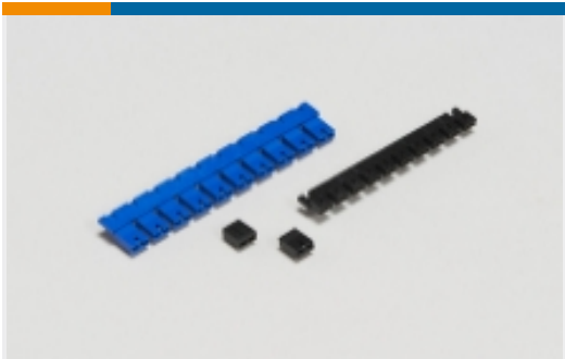
Board-to-Board Jumpers & Shunts(7)