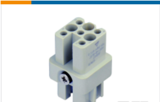
TE Part # T2020072201-000 HD-007-F