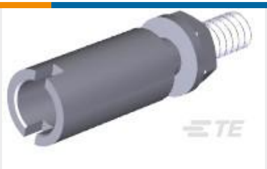
TE Part # 1-200835-1 SERIES"M" MIN. RECT. GUIDE SOC