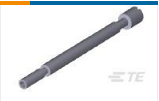
TE Part # 207235-1 UNASSM JS KIT,M SERIES