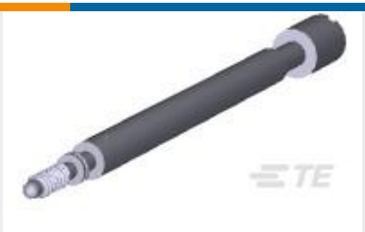
TE Part # 201911-1 JACKSCREW KIT