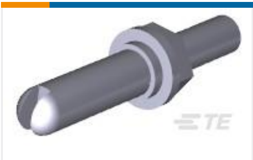
TE Part # 1-200833-1 SERIES"M" GUIDE PIN ST. STL.