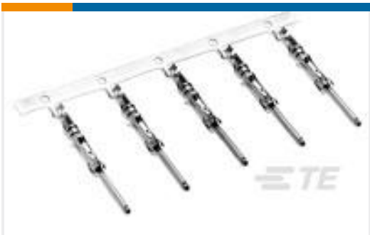
TE Part # 66102-6 III+ PIN,24-20,30AU>10,STRIP