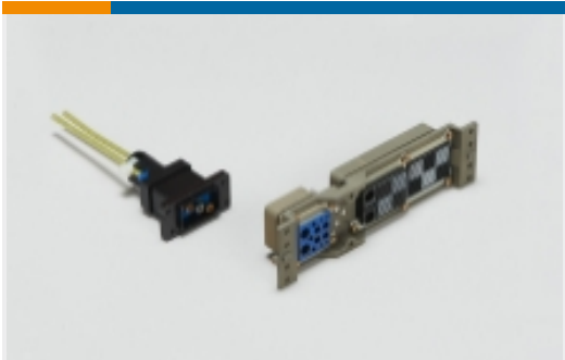
Rack & Panel Connectors(1)