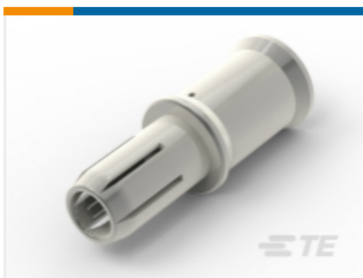
TE Part # T2400002160-000 CSF-16