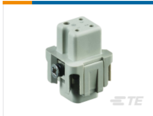
TE Part # T2010032201-000 HA-003-F