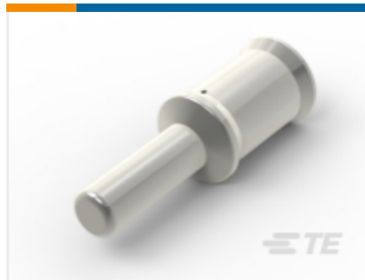
TE Part # T2400001160-000 CSM-16