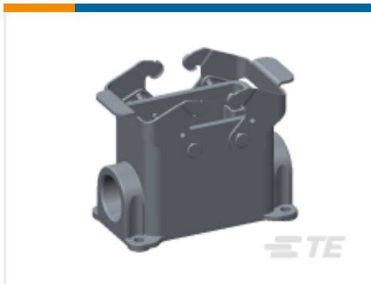
TE Part # T1440102120-000 H10B-SGR-M20