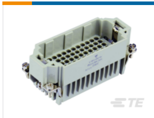
TE Part # T2030722101-000 HDD-072-M