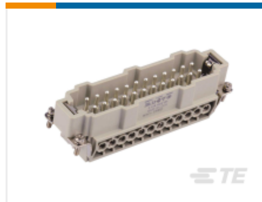
TE Part # T2040242101-000 HE-024-M