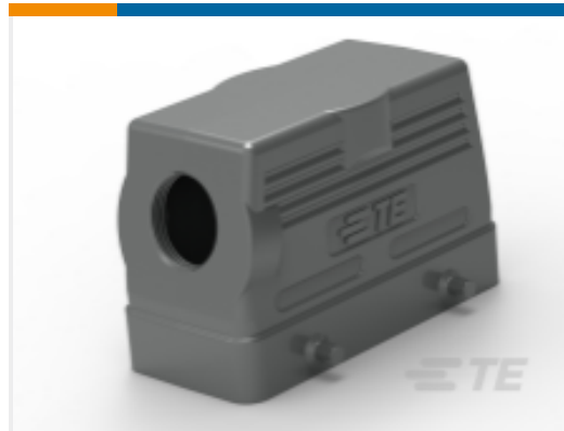
TE Part # T1210160125-000 H16B-TS-M25