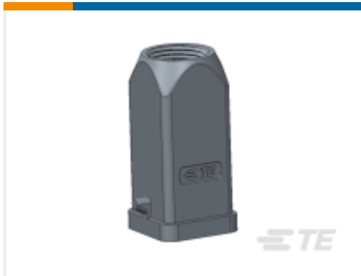
TE Part # T1329030120-000 H3A-MTG-M20