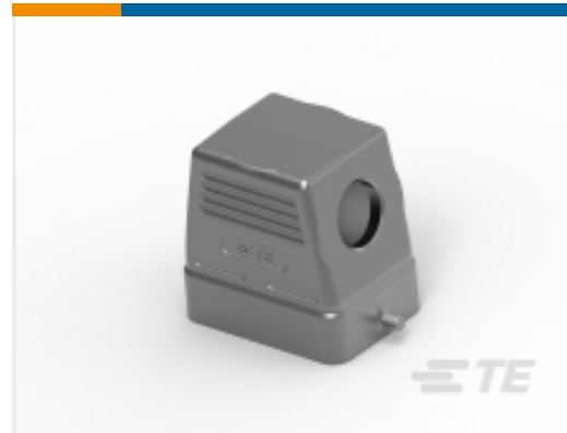
TE Part # T1310060120-000 H6B-TS-M20