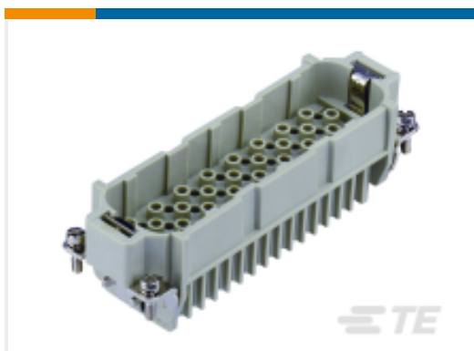
TE Part # T2020642101-000 HD-064-M