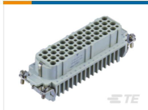
TE Part # T2020642201-000 HD-064-F