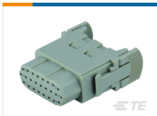
TE Part # T2111252201-000 HMN-025-F