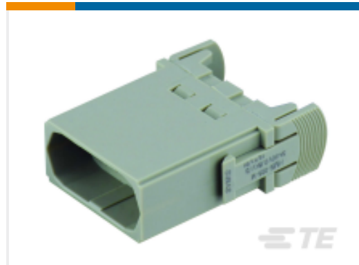
TE Part # T2111252101-000 HMN-025-M