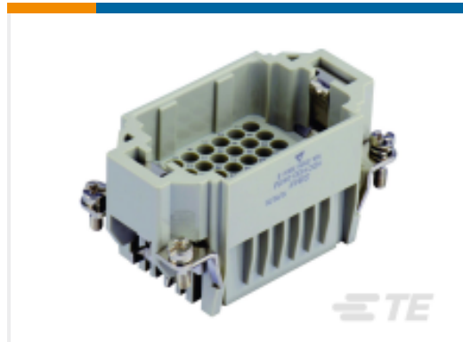
TE Part # T2030422101-000 HDD-042-M