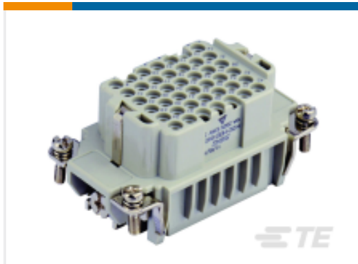
TE Part # T2030422201-000 HDD-042-F