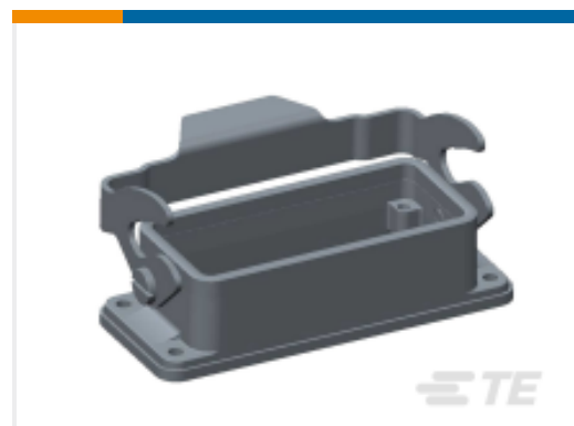
TE Part # T1500163000-000 H16B-AG-LB