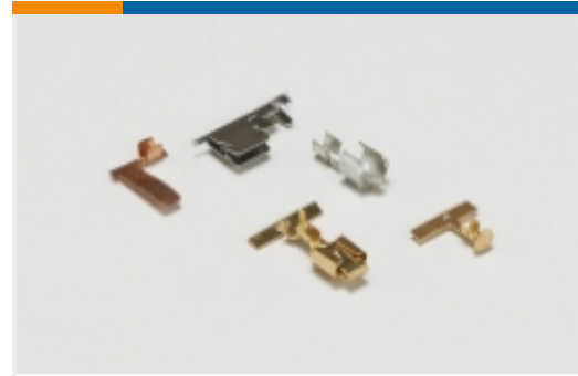
Special Purpose Terminals(1)