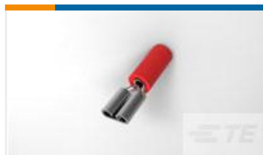
TE Part # 640917-2 RECEPT,PIDG FASTON 22-18 187