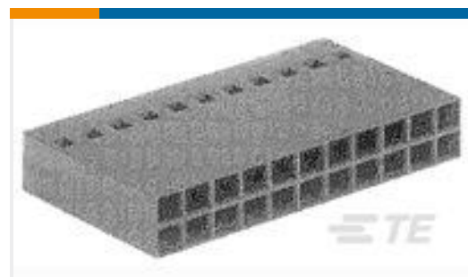
TE Part # 104482-7 16 SHORT PT RCPT HSG DR .100CL