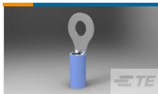
TE Part # 2-320563-2 TERMINAL,PIDG R 16-14 1/4