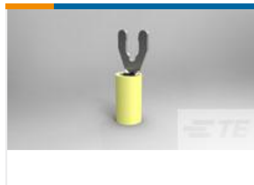
TE Part # 52943-1 TERMINAL,PIDG SPR SPD 12-10 10