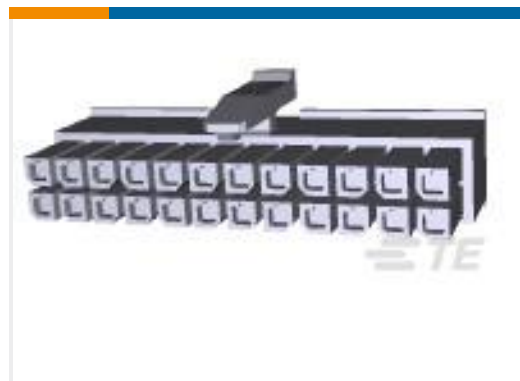
TE Part # 2-794617-4 24POS,MICRO MNL,RCPT HSG