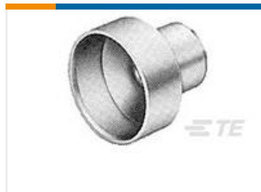
TE Part # 3-747579-2 SHLDNG FERRULE, PLTD, BULK PKG