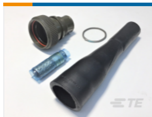
TE Part # 571823N001 6120-10-561120-CS2359