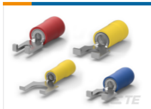
TE Part # 320861 PIDG Flanged Spade Tongue Terminals