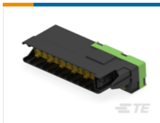
TE Part # 1544266-2 FUSE BOX ASSY HARD WIRED BFH12 WO BUSBAR