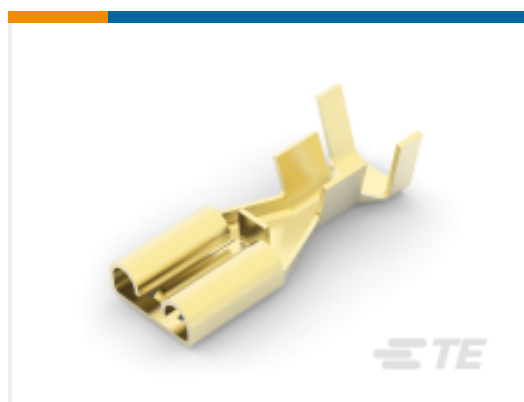
TE Part # 1217092-1 PL 250 TERMINAL RECEPTACLE 16-12 AWG BR