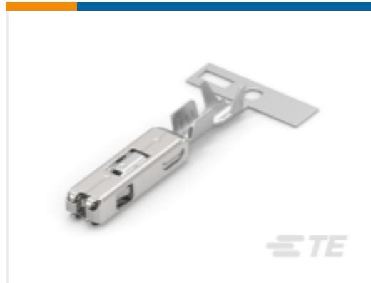
TE Part # 1670326-3 1.5MM SFC, CONTACT