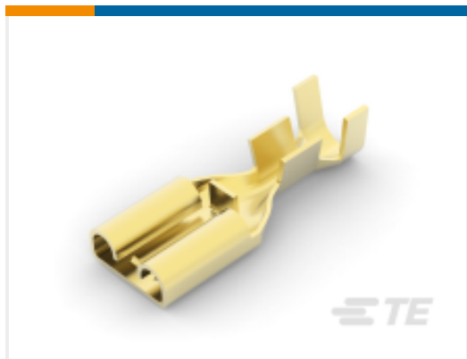
TE Part # 63854-1 250 PL MKIII REC. 18-14AWG BR