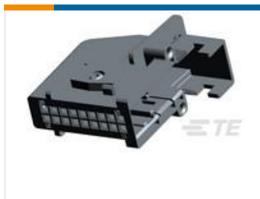
TE Part # 1379101-5 COV+LEV MQS 18W 90DEG GREEN