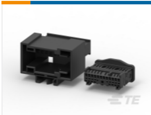
TE Part # 1379914-1 MQS, CONNECTOR HOUSING