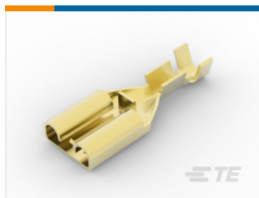
TE Part # 63933-1 PL .250 TERMINAL REC 22-18 AWG BR