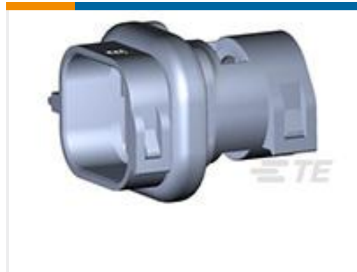
TE Part # 1801155-5 COVER FOR 2W HP CONNECTOR