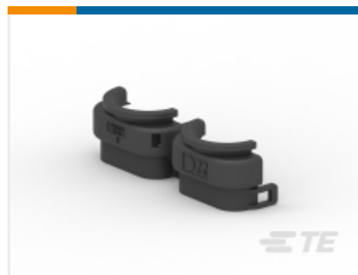
TE Part # 1801359-1 ADAPTER, ROTATIVE COVER FOR 3W CONN