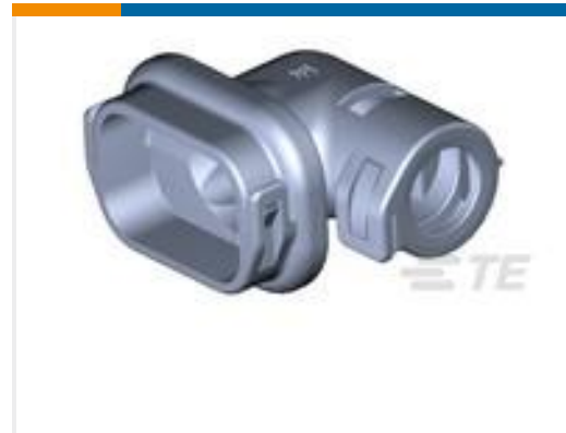
TE Part # 1801467-1 COVER, FIXED, 3 WAY HP CONNECTOR