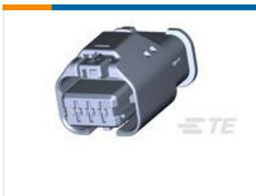
TE Part # 1-1801178-2 3W RECEPTACLE HP CONNECTOR BLUE