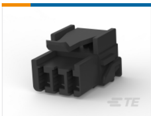
TE Part # 953043-1 PL LOCKING LEVER 3P HOUSING PA6.6 NOIR