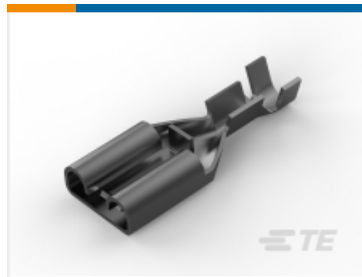
TE Part # 63933-2 250 PL MKIII REC. 22-18AWG TPBR