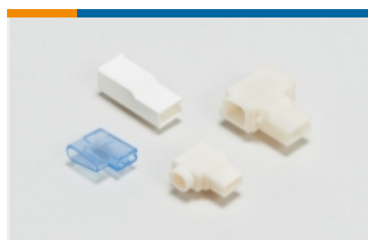
Crimp Terminal Housings(30)