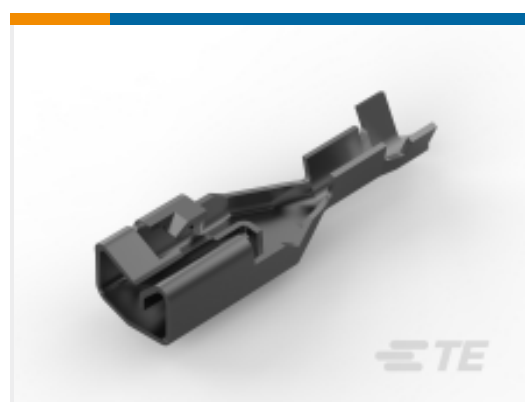
TE Part # 141991-2 PL 5MM 0.35 DEG TO 1 DEG POST-TPBR