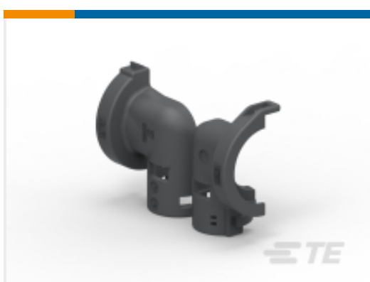
TE Part # 1801468-1 COVER, ROTATIVE, 3 WAY HP CONNECTOR