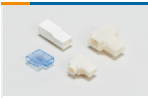
Crimp Terminal Housings(6)