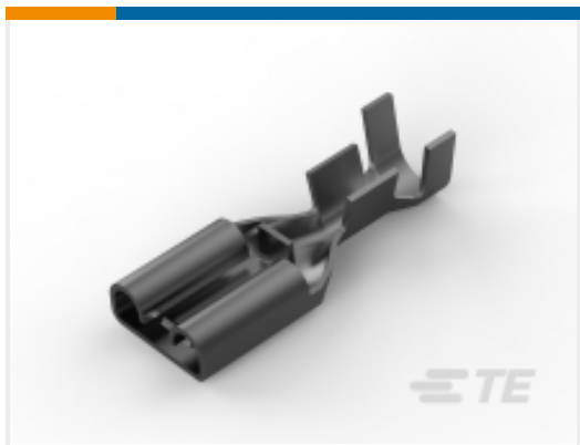
TE Part # 63854-2 250 PL MKIII REC. 18-14AWG TPBR