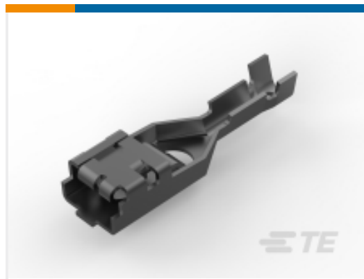
TE Part # 142685-3 L.I.F PL CONTACT 5MM 0.35-1 MM2 PTPPHBZ