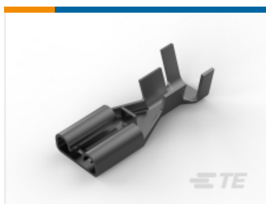
TE Part # 1217092-2 PL 250 TERMINAL REC 16-12 AWG TPBR