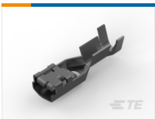
TE Part # 142686-1 L.I.F PL CONTACT 5MM 1 TO 3 MM2 PTPPHBZ