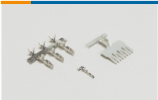
Busbars & Terminals(1)