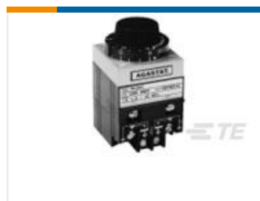
TE Part # 1423160-3 7014AC=RLY,STD,ON,4P,120VAC,20