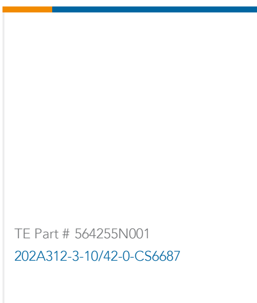
TE Part # 564255N001 202A312-3-10/42-0-CS6687