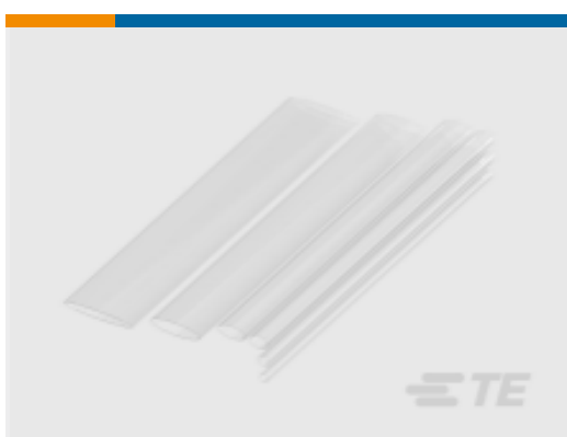
TE Part # NB19684001 RNF-100-3/32-CL-SP