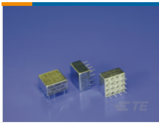
TE Part # 1-1617076-4 3SBH1145A2 = M39016/14-005L