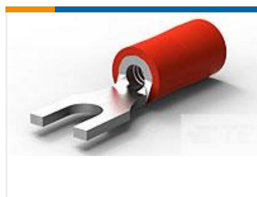
TE Part # 165004 PLASTI-GRIP, SPADE 22-16 4