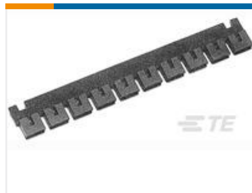
TE Part # 382575-2 2MM MINI-SHUNT ASSEMBLY 15 AU