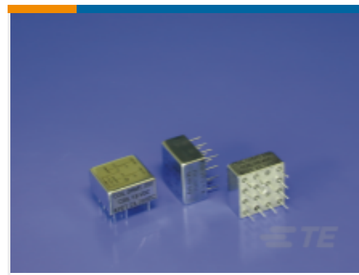
TE Part # CAT-3SBH-4PDT-WCS 4PDT Signal Relay: Electrically-Held, With Coil Suppression