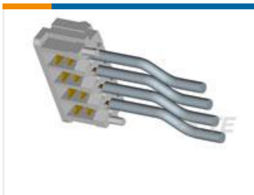
TE Part # 1-173977-3 CT CONN MT REC ASSY 13P