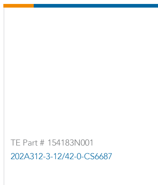
TE Part # 154183N001 202A312-3-12/42-0-CS6687