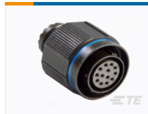
TE Part # YDTS26W09-98SNV001 PLUG ASSY