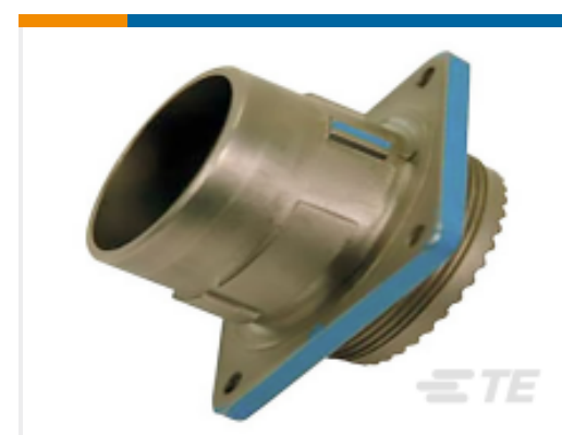
TE Part # YDIV40E21-41SCC003 RECP ASSY