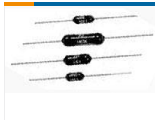
TE Part # 8-1879663-6 H8 825R 0.1% 15PPM