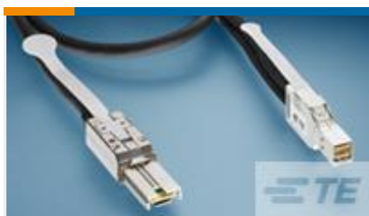
TE Part # 2202508-2 C/A, 4X MINISAS HD TO MINISAS, 28AWG, 1M