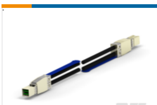
TE Part # 2-2337815-2 MINISAS HD TO MINISAS HD,30AWG, 1M