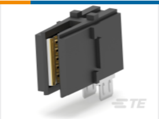
TE Part # 2178531-4 Crown Clip Junior AG Plating Reflow