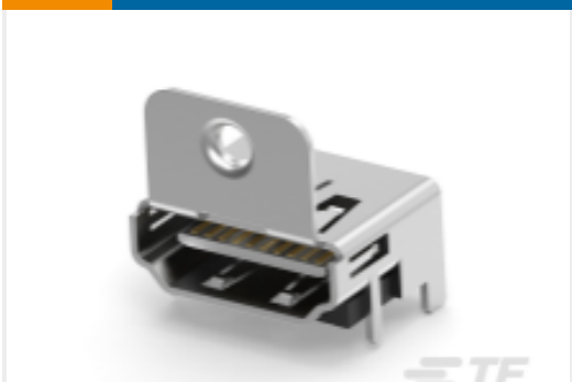
TE Part # 1-1747981-9 TRAY PACKAGE HDMI CONNECTOR SMT