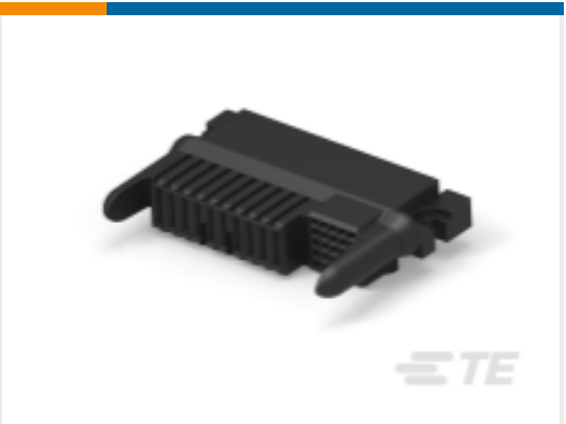
TE Part # 8-1926739-3 ASSYMINIPAK HDL25S10PRARECPTSC