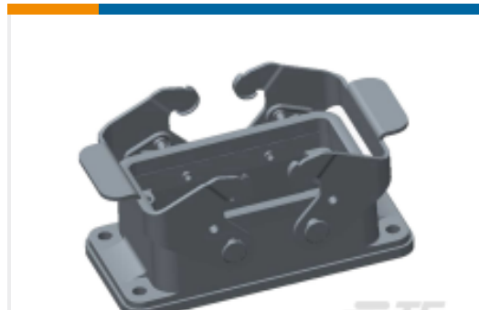
TE Part # T1410102000-000 H10B-AG