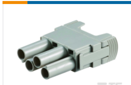
TE Part # T2111042201-000 HMN-004-F