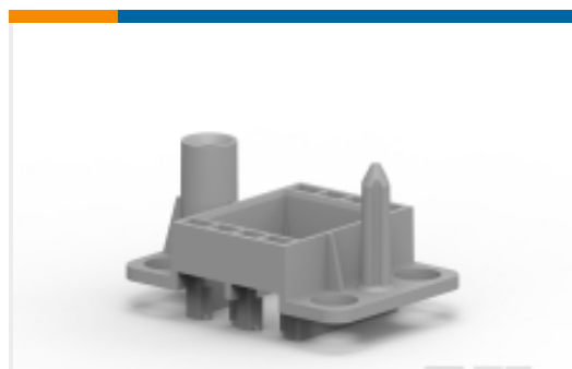
TE Part # T2071064101-000 H6BP-T2-M DOCKING FRAME_FLOATING