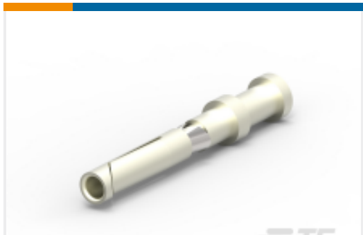
TE Part # T2020002002-000 CDF-0.3