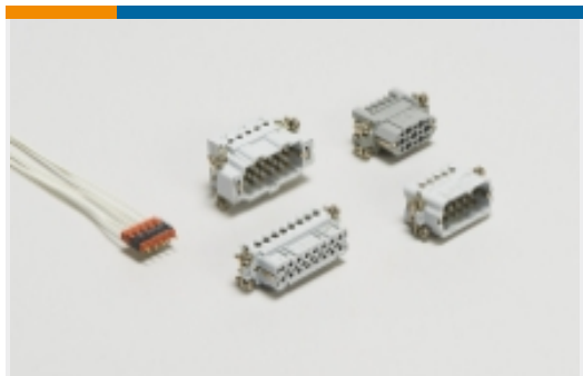
Rectangular Contact Inserts(119)