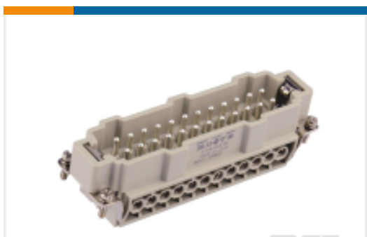
TE Part # T2040242101-000 HE-024-M