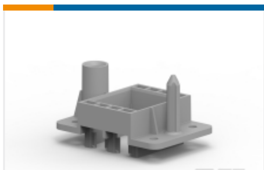
TE Part # T2071064201-000 H6BP-T2-F DOCKING FRAME_FIXED