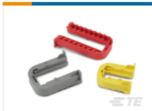
TE Part # 1670720-1 Heavy Duty Sealed Connector Series Fixing Slides