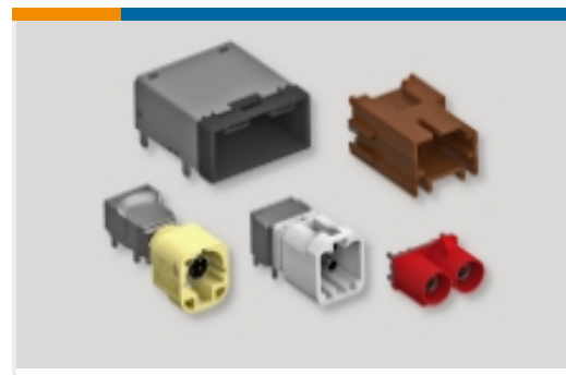
Data Connectivity Headers(2)