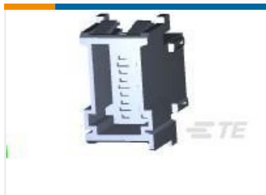
TE Part # 3-965641-1 TAB HSG 2.8MM 6POS.