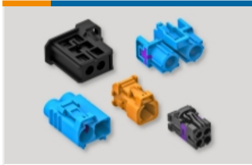
Data Connectivity Housings(16)