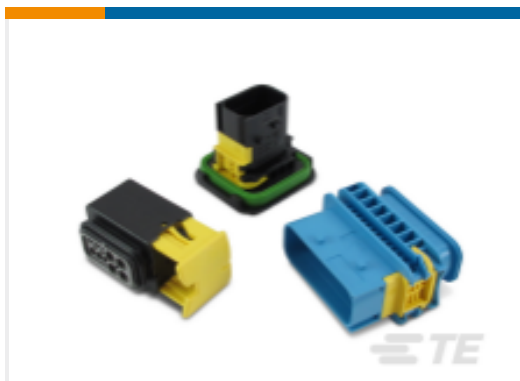
TE Part # 1-1670214-1 Heavy Duty Sealed Connector Series Housings