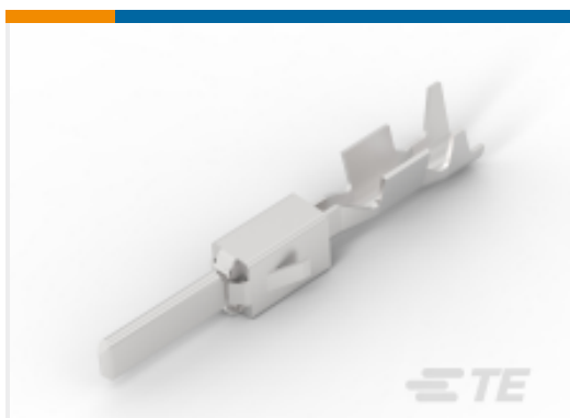
TE Part # 1-963746-2 SPECIAL TERMINAL 17-13 AWG SLIPBR LP