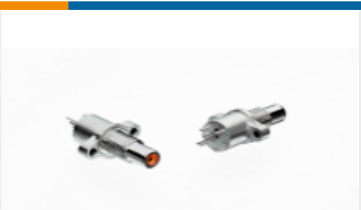
TE Part # EM6482-000 DK-621-0440-SM-L20