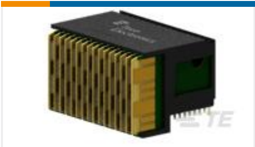
TE Part # 2102870-1 DC, 7Row, Right End, MULTIGIG RT 2R