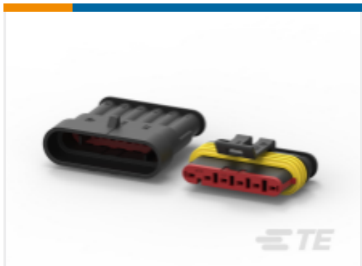
TE Part # 282104-1 AMP SUPERSEAL 1.5MM, CONNECTOR HOUSING