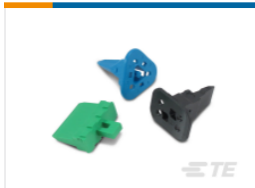
TE Part # W2S Wedgelocks: DEUTSCH DT