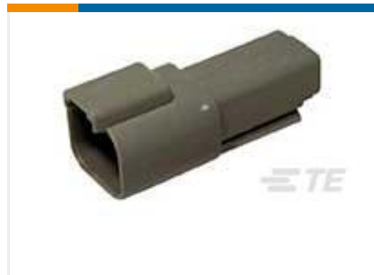
TE Part # DT04-2P REC, 2P, GRY, N