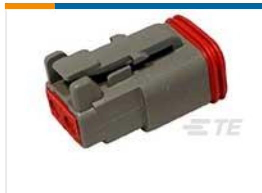
TE Part # DT06-2S PLG, 2P, GRY, N