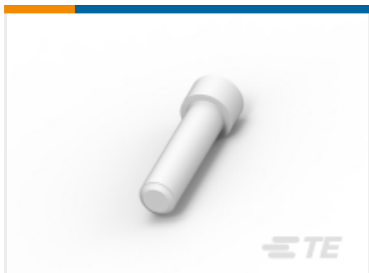
TE Part # 114017-ZZ SEALING PLUG, SIZE 12/16, WHT