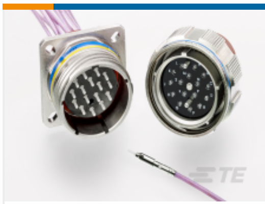
TE Part # YMC8016-W-25-32SN0 ARINC 801, TYPE 1 PLUG CONNECTOR