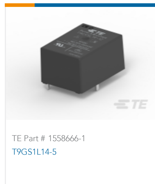
TE Part # 1558666-1 T9GS1L14-5