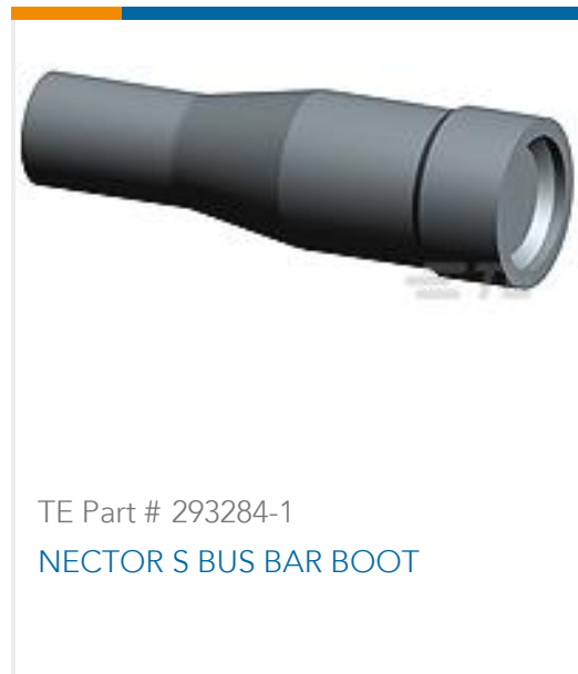
TE Part # 293284-1 NECTOR S BUS BAR BOOT