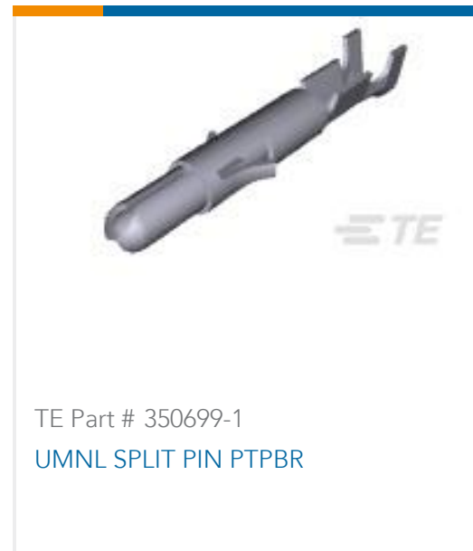
TE Part # 350699-1 UMNL SPLIT PIN PTPBR