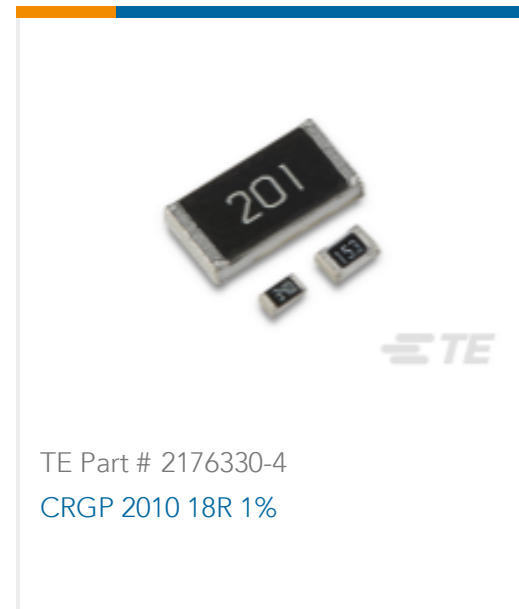
TE Part # 2176330-4 CRGP 2010 18R 1%