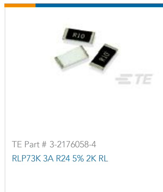
TE Part # 3-2176058-4 RLP73K 3A R24 5% 2K RL