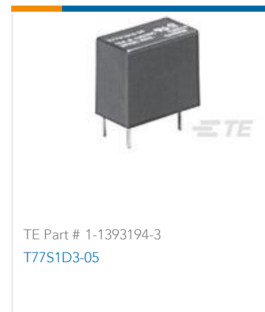
TE Part # 1-1393194-3 T7S1D3-05