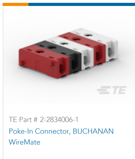
TE Part # 2-2834006-1 Poke-In Connector, BUCHANAN WireMate