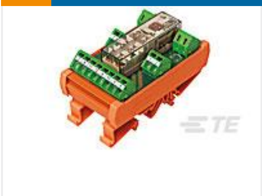
TE Part # 5-1415060-1 SR6ZC615