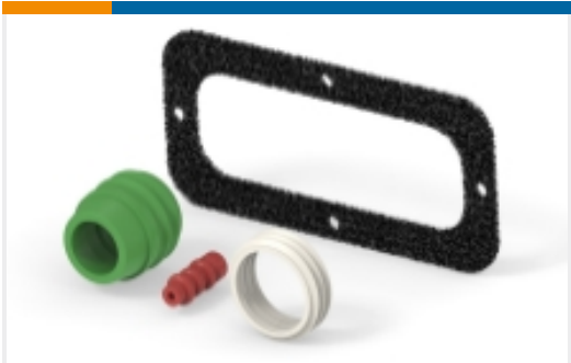
Connector Seals & Cavity Plugs(36)