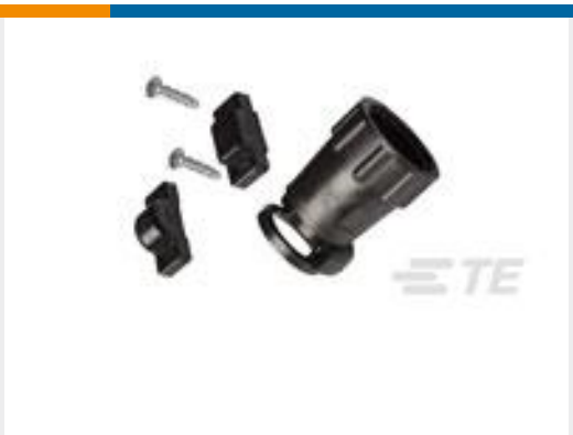
TE Part # 206966-7 CABLE SHELL CLAMP SIZE 13