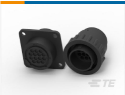
TE Part # 182651-1 CPC EMEA