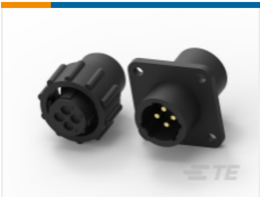
TE Part # 206705-2 Cable/Panel Mount Connector, CPC Series 1