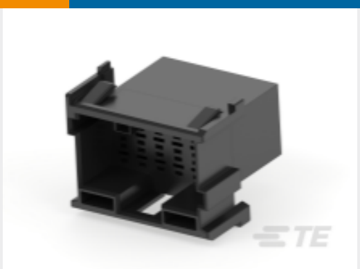
TE Part # 967204-1 FLA-STE-GEH2,8 17P