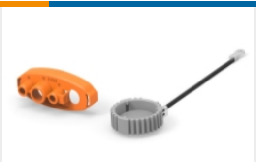
Connector Caps & Covers(16)