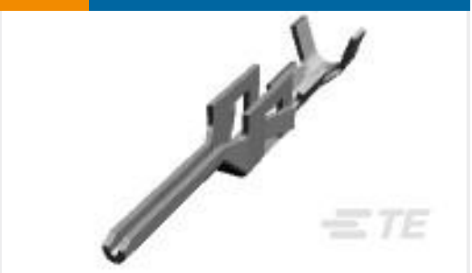
TE Part # 1-794613-0 PIN CONT 26-30 TIN PLATE L/P