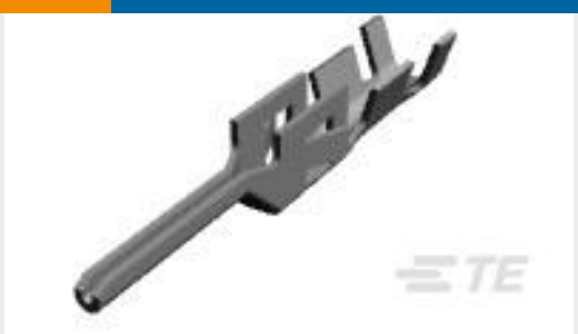
TE Part # 1-794612-1 PIN CONT 20-24 15 GOLD L/P