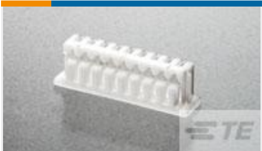
TE Part # 1-440146-2 1.25mm WTB Socket,Housing,12p