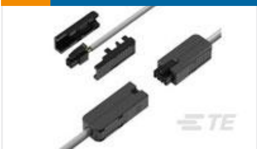
TE Part # 293734-1 4 pos. coverpart (kit) for P/N 794617-4