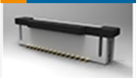
TE Part # 1-1734248-6 1.0 FPC, ZIF V/T, SMT, 16P