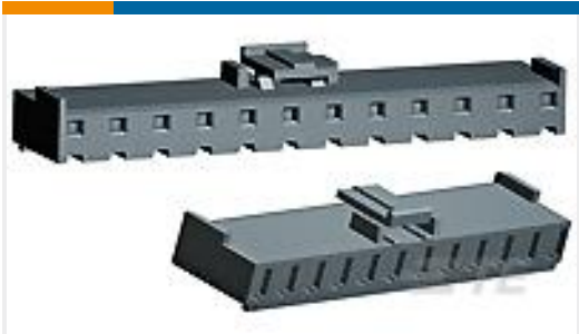
TE Part # 1744036-5 05P ECONOMY POWER .200 CL HSG