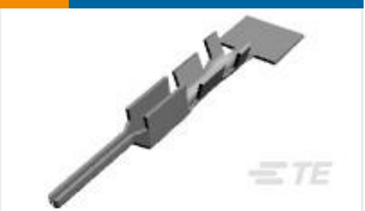
TE Part # 1-794608-2 PIN CONT 20-24 30 GOLD STRIP