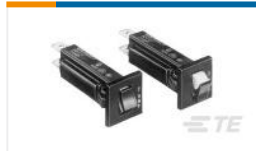
TE Part # 6-1393250-3 W28-XT1A-10=W28