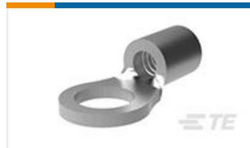
TE Part # 33457 TERMINAL,SOLIS R 12-10 10