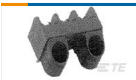
TE Part # 3-1437659-6 8STR-03-006=#8 TRIBARRIER TERM