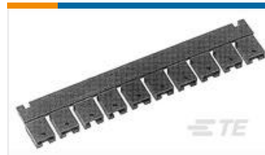
TE Part # 382811-8 SHUNT, ECON, PHBR 5AU, BLACK