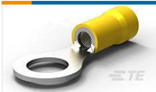
TE Part # 34856 TERMINAL,PG R 12-10 5/16