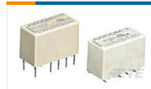
TE Part # 3-1393788-3 V23079B1201B301