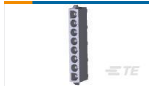
TE Part # 643410-1 08P UMNL PIN HDR ASSY POL 94VO