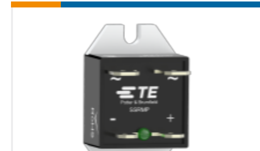
TE Part # 2323802-3 SSRMP-240D10 = Mini Puck,10A,240V AC