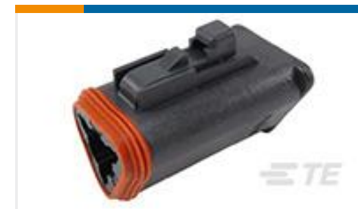
TE Part # DT06-3S-P032 PLG, 3P, BLK, N, INTEGRATED ADAPTER