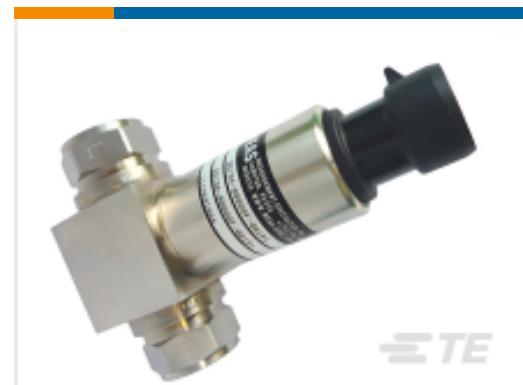
TE Part # D5154-000005-015PD PRESS XDCR D5154-000005-015PD