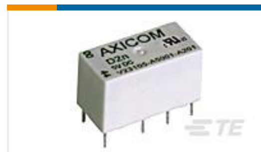
TE Part # 9-1393792-9 V23105A5305A201