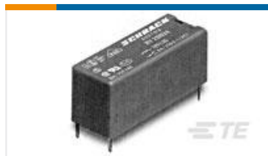
TE Part # 2-1393225-1 RY611024