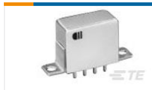
TE Part # 1617004-9 B07D034BB2-0120 = M5757/23-010