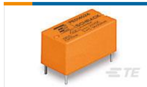
TE Part # 3-1415390-1 PE014F12