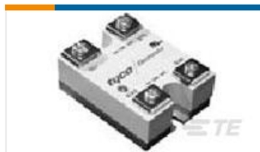
TE Part # 1393030-7 SSR-240D25= PANEL MOUNT,25A, 240VAC-DC i/p