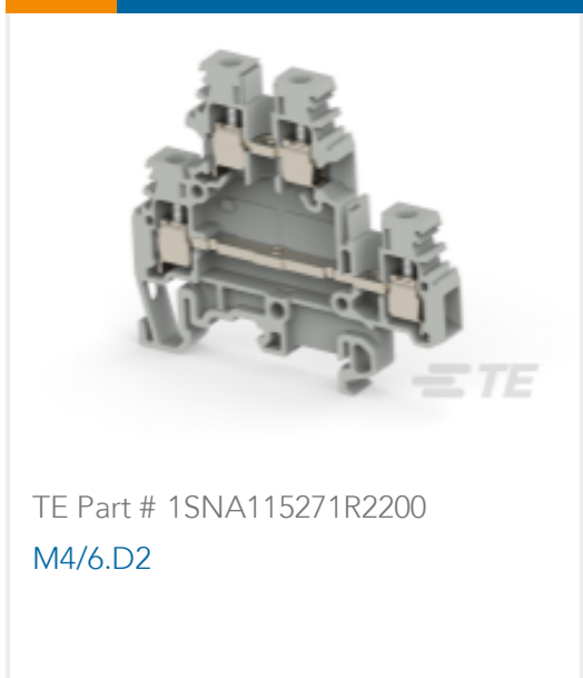
TE Part # 1SNA115271R2200 M4/6.D2