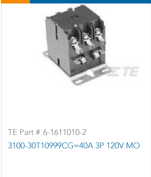
TE Part # 6-1611010-2 3100-30T10999CG=40A 3P 120V MO