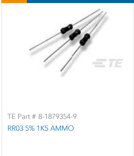
TE Part # 8-1879354-9 RR03 5% 1K5 AMMO