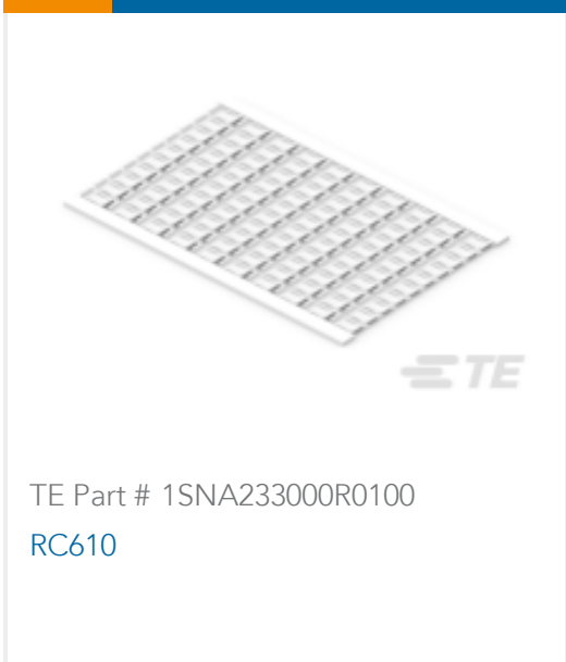
TE Part # 1SNA233000R0100 RC610