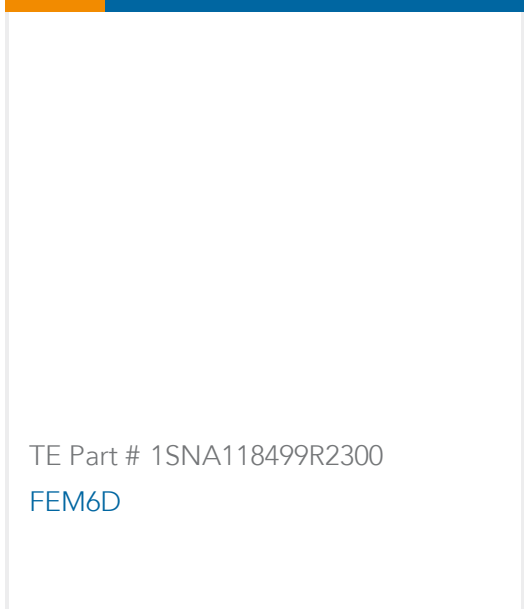
TE Part # 1SNA118499R2300 FEM6D