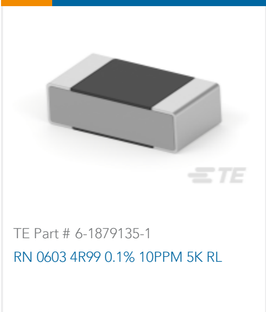
TE Part # 6-1879135-1 RN 0603 4R99 0.1% 10PPM 5K RL