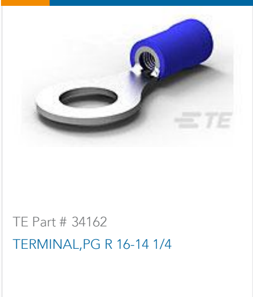
TE Part # 34162 TERMINAL,PG R 16-14 1/4