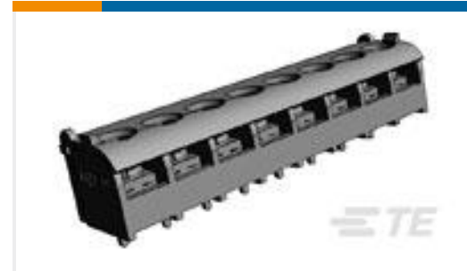
TE Part # 1546927-8 8P .325 TRI-BARRIER W/COVER