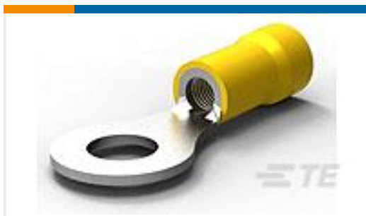
TE Part # 34855 TERMINAL, PG R 12-10 1/4