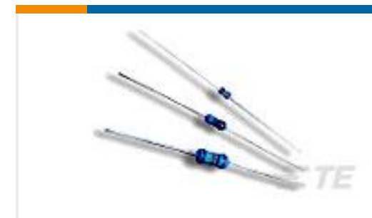
TE Part # 1622796-6 YR1 0.1% 10K