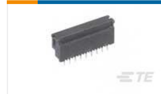
TE Part # 487925-2 14 ZIF LINE ASSY .100C/L