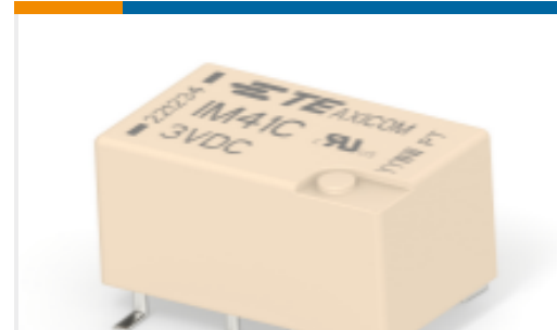
TE Part # 4-1462039-2 IM41CGR=IM RELAY 100mW 3V BIS