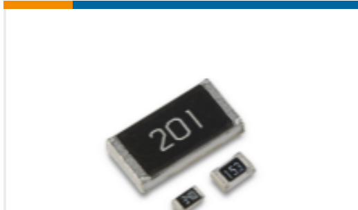
TE Part # 1-2176329-5 CRGP 1210 150R 1%