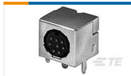
TE Part # 5749267-1 Mini DIN, 8 pos, R/A, Shield