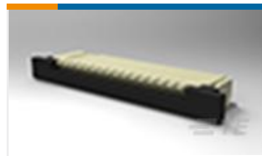
TE Part # 2-84953-2 1MM FPC HORZ.TOP CONT.ASSY 22P