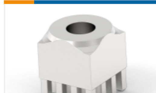
TE Part # 225683-E POWELM BUCHSE VOLLM M5 4 2,54 * EP 7 CUS