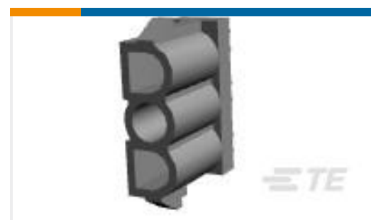
TE Part # 173925-1 3 P ACTION PIN UMNL