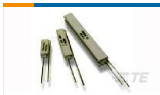
TE Part # 1623732-4 BCHE 7 W 120R 5%