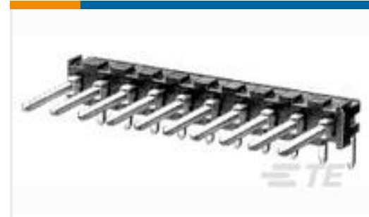
TE Part # 827795-5 5P MOD2 STIFT LEI