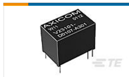
TE Part # 3-1393779-7 V23101D 107A301