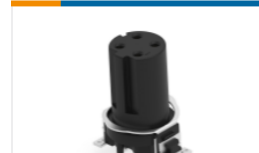
TE Part # 484937-E M12 FEMALE, D CODE, 4P, 17MM SMT