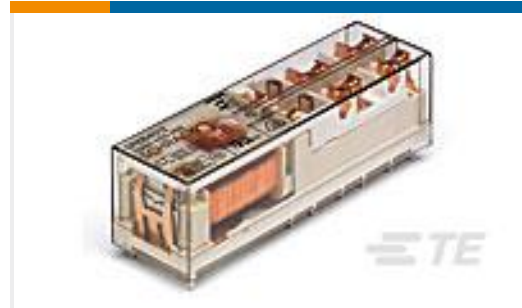
TE Part # 5-1415537-8 SR6A6K05