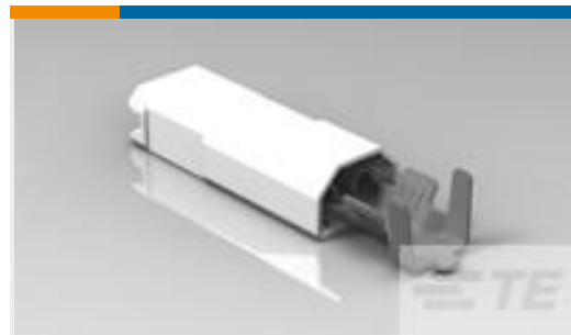
TE Part # 521293-2 ULTRA-POD 187 ASSY REC 18-16 AWG TPBR