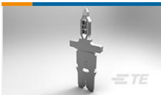
TE Part # 2120745-2 MAG-MATE Slim Line with Multispring