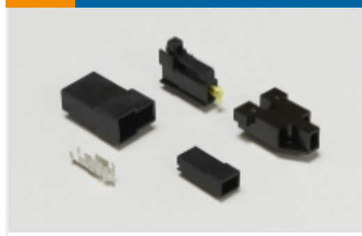
Magnet Wire Terminals(192)