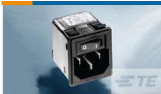
TE Part # 2-1609113-9 6CUFS1=F8300