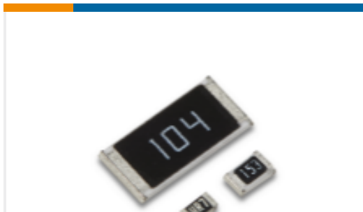
TE Part # 6-2176347-1 CRGCQ 2010 1M0 1%