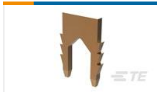
TE Part # 2-1601140-1 153-004-000=LEADLOK2,SMZ