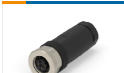
TE Part # T4110502031-000 M12,FEMALE,STRAIGHT,D CODE,3P, PG9,GOLD