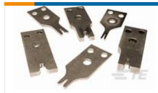
TE Part # 8-655830-7 INSULATION CRIMPER