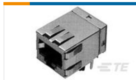
TE Part # 5406299-1 MJ ASSY,S/P,8POS,SH,RVPGT,CAT 5e