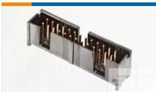
TE Part # 5103308-2 A/L LOW PRO HDR 14P VERT BLACK