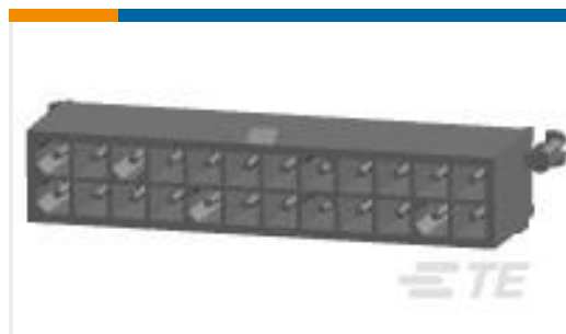
TE Part # 1-794079-0 24P MINI UMNL HDR W/O DH SN LF