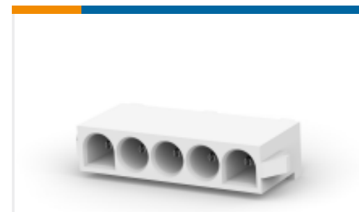
TE Part # 1586134-1 05P UMNL PIN HDR V2 NATL NDH