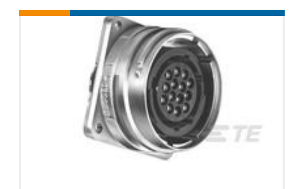
TE Part # 208721-1 RECEPT ASSY,SZ 14,CMC