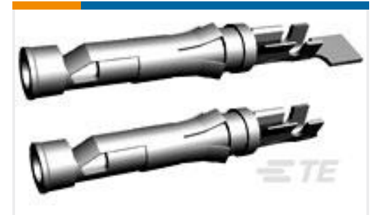
TE Part # 66360-1 III+ SKT,18-14,30AU>10,LP