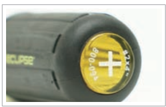
The screw symbol and tip size marking is on the handle end