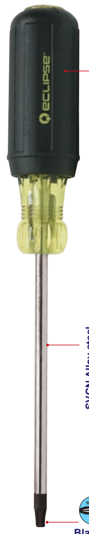
Ergonomic and soft cushion handle