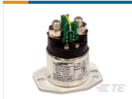
TE Part # K1006083 Relay 30-313-12