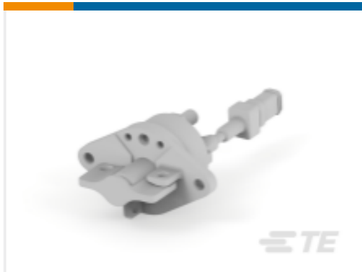
TE Part # K1138460 Batt. Disconnecter 35-514-231-R-A5-901