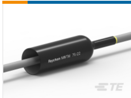
TE Part # 385152-000 MWTM-75/22-1000/S(S5)