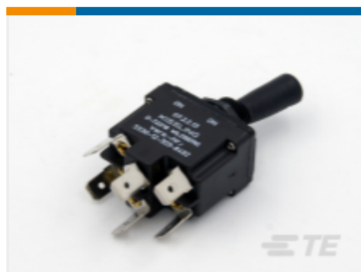
TE Part # K1002981 Toggle Switch 07-2-2-13