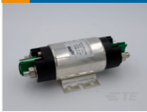
TE Part # CAT-AL6-KSPR29200 Power Relay, 200A, Standard, Monostable, DC