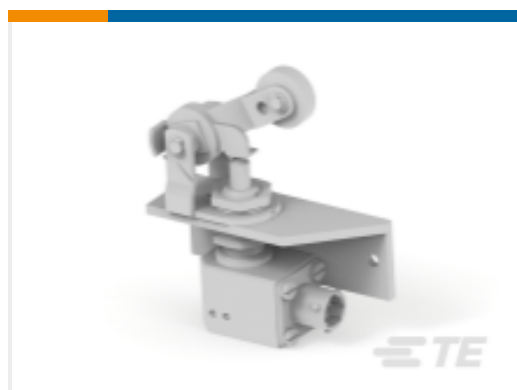
TE Part # K2017618 Limit switch G13-01-1091