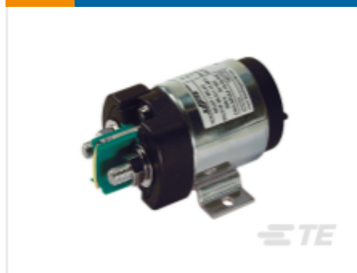
TE Part # CAT-AL6-KSPR30200 Power Relay, 200A, Standard, Bistable, 2 Coils, Polarized