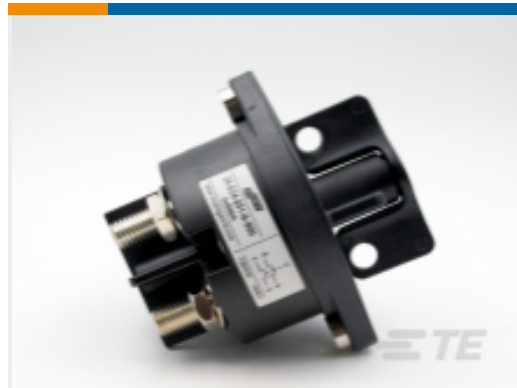
TE Part # K1156392 Battery Disconnecter 35-524-231-R-A-906