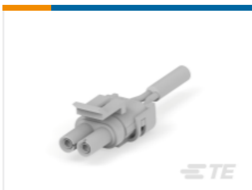
TE Part # K1166669 Foot Switch 44-03-008-1